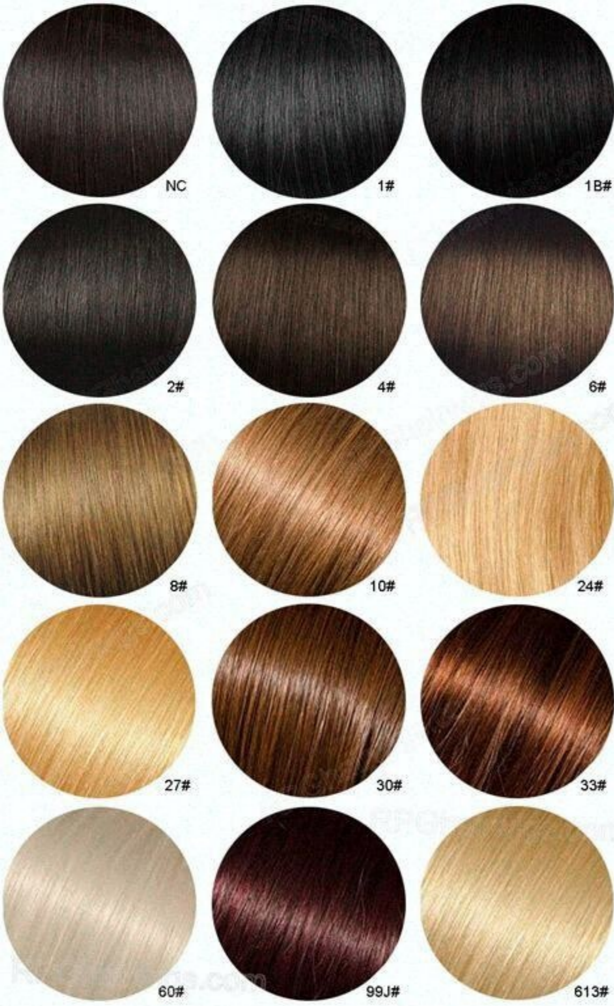
Ion inspired by nature colors. Ion inspired by nature reviews.

Ursula Goff, a colorist from Kansas, curates a unique Instagram gallery that pairs her hair color creations with the natural wonders that inspire them. Her portfolio showcases a diverse range of hues and patterns, often drawing from unexpected combinations found in nature, such as geothermal pools, timber textures, precious stones, and floral blooms. Goff's approach to hair color is an artistic endeavor, where she meticulously crafts each look to reflect the beauty of the natural world.