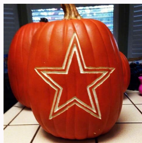
Dallas cowboys pumpkin carving ideas.