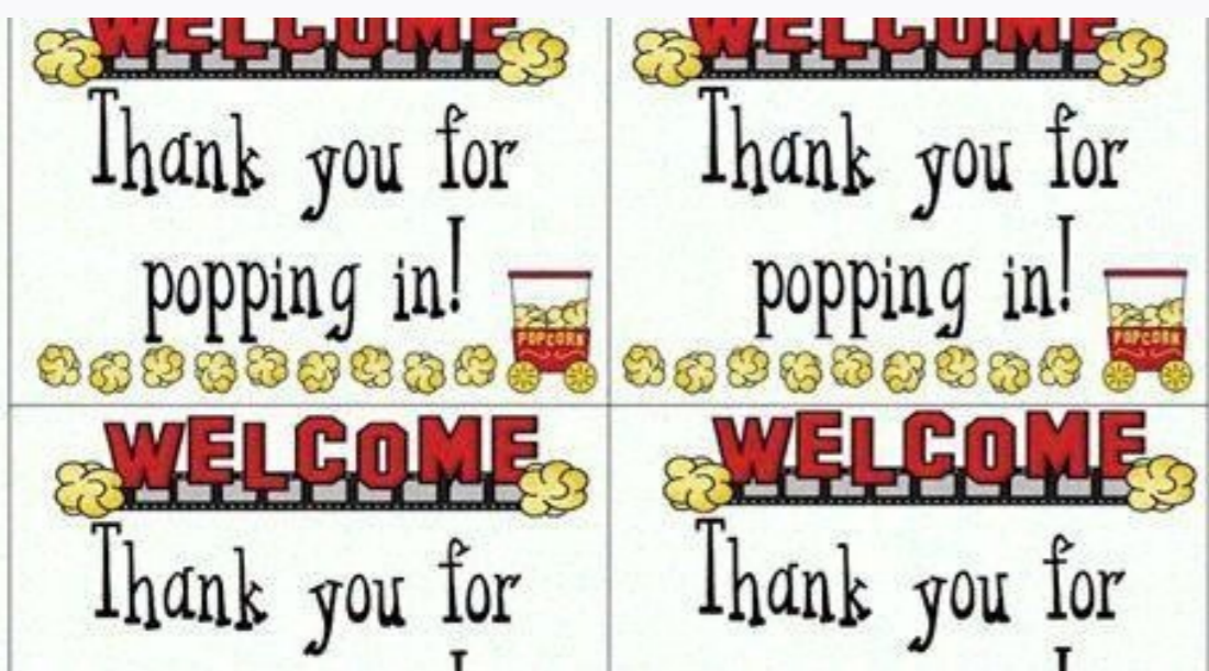
Thanks for popping by baby shower free printable.

"Ready to pop baby shower" tags/labels/printables are a sweet way to personalize your favors or prizes. They're versatile because they can be matched with anything that pops! What You'll Need To Create "Ready To Pop Baby Shower" Favors and/or Prizes For the tags A color printer. Scissors or a cutting machine to cut out your tags/labels; A one-hole punch, cardstock paper, and ribbon if you are tying the tags to a bottle or gift basket; or Regular paper and glue or sticker paper if you are pasting the tags onto a bottle or paper bag. For the product This will depend on your budget. You could go with: Mini bottles of champagne; Bottles of soda; Popcorn; Cake pops; Rice Krispie pops; Lollypops, etc.