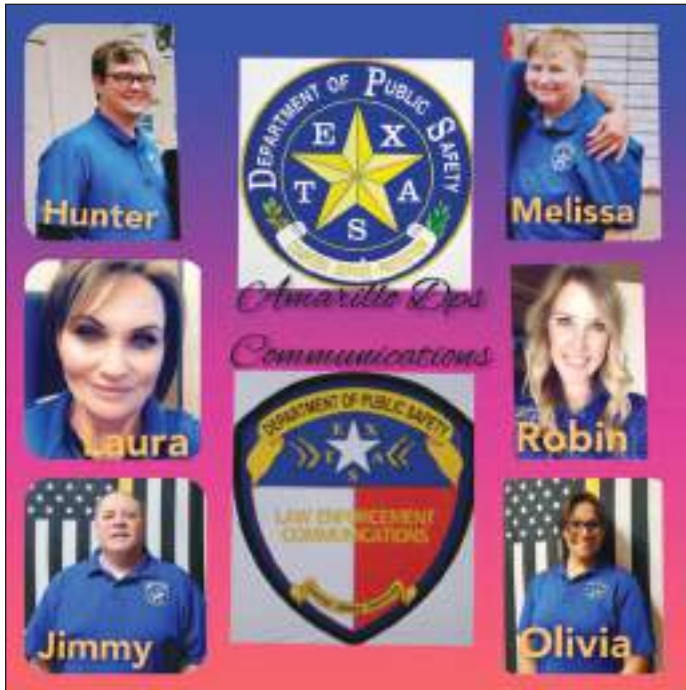
DPS Amarillo appreciates their communications personnel during Comm Week and the rest of the year too.

pay increase, a better retirement plan, or anything that has to do with money will never be easy and it will never happen quickly. DPSOA is the only association that fights for you specifically as a DPS employee. No other agency has the resources to work one-on-one with the legislators specifically for YOU as a DPS employee. DPSOA has been working and will continue to work for all these things and more, specifically for Troopers, Rangers, CID, Lab Personnel, and Communications. It is not fast. It will not be immediate. There may not even be support from anywhere else. But we will work until it happens.