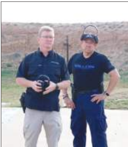
Midland Retiree Shoot.