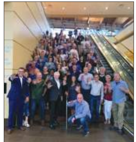
NTC Conference in Branson, MO.

The Red River Veterans' Memorial is a wonderful place that pays respect to our veterans. Make sure you stop by.