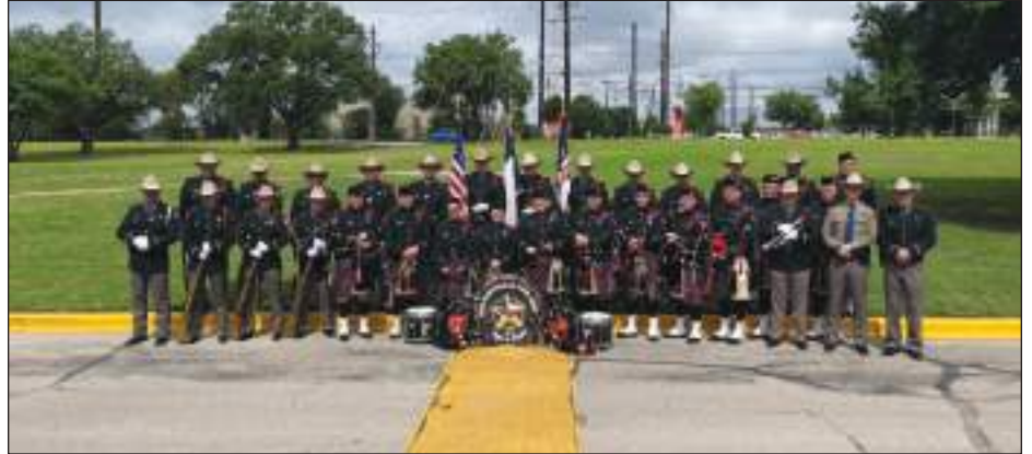
DPS Honor Guard at the Law Enforcement Memorial at Headquarters in Austin.