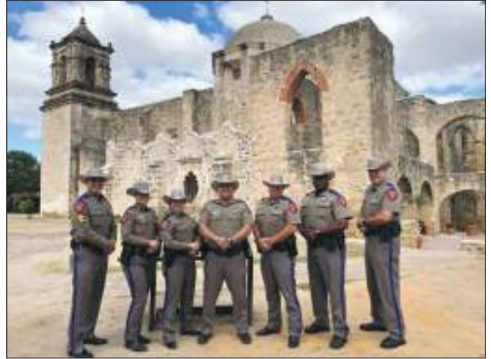
Members of Sergeant Area 6C13 San Antonio in front of the Alamo.