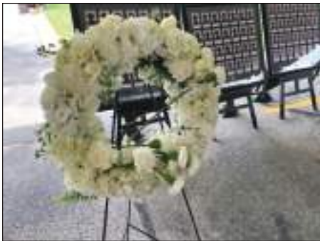
Law Enforcement Memorial Service held at DPS Headquarters in Austin.