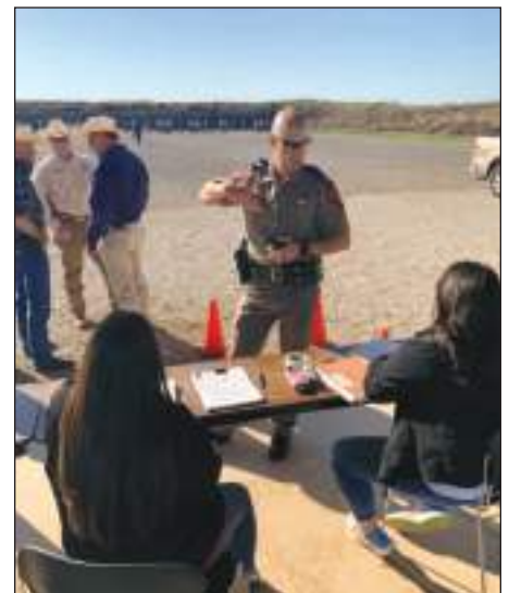
San Angelo Retiree Shoot.

thank the following companies that helped to make this race a success: