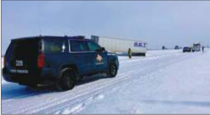
Just another Day in the Northwest Texas Region.

When most of us hear about traffic accidents and bad drivers, we do not generally believe that we are the problem – it is the other drivers who we must worry about. That seems to be the same idea most people take when they think about dying and life insurance. This year and in recent years we have had our worst-case scenarios play out in real life with felonious assaults on Troopers. This hits home for almost all of us as we reach out to help our DPS family, consider safety issues in our own jobs, and deal with the reality that our world is changing in ways that could destroy everything we have worked for if we do not plan for it. This article is just to clarify the options we have with DPS and outside of DPS to plan for the critical financial issues.