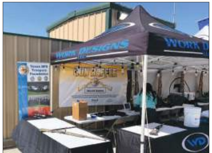
Raffle booth at TANMAR Rentals crawfish boil in Midland.