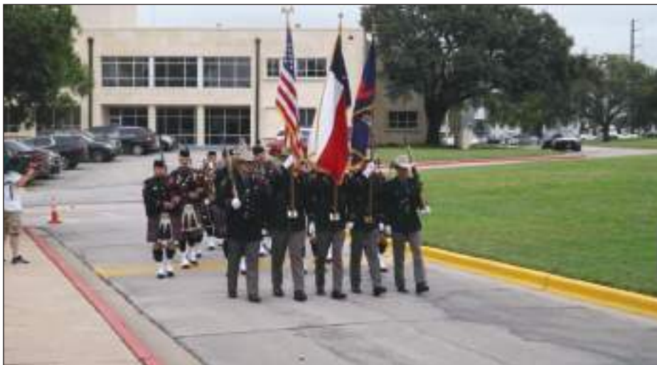
Honor Guard at PO Mem.

session. Many bills were passed and DPSOA representatives spent countless hours advocating for our Troopers. We owe our representatives a debt of grat-