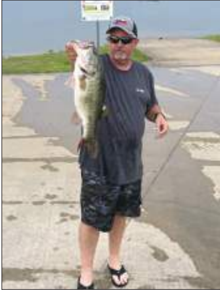
Bass tournament at Lake Bob Sandlin in Mount Pleasant. This 'Big Ass Bass' winner weighed 6.2 lbs.