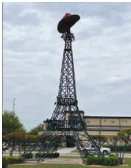
YES.... Paris Texas HAS an Eiffel Tower...with a RED Cowboy hat on top.

The Red River Veterans' Memorial is a wonderful place that pays respect to our veterans. Make sure you stop by.