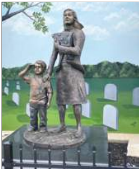
The Red River Veteran's Memorial.

wars. There is another memorial at this site honoring K-9 veterans as well.