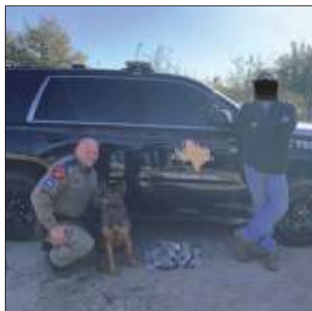
CID Special Agents assisted by THP Canine seize 9 pounds of methamphetamine