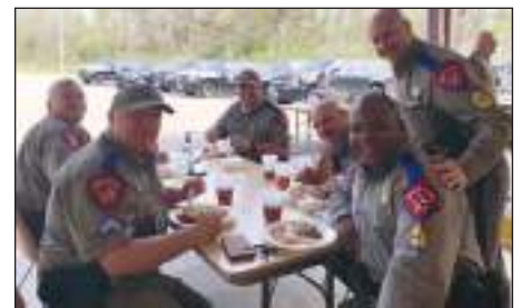
Three pictures of CVE troopers participating in the Texas Challenge event.