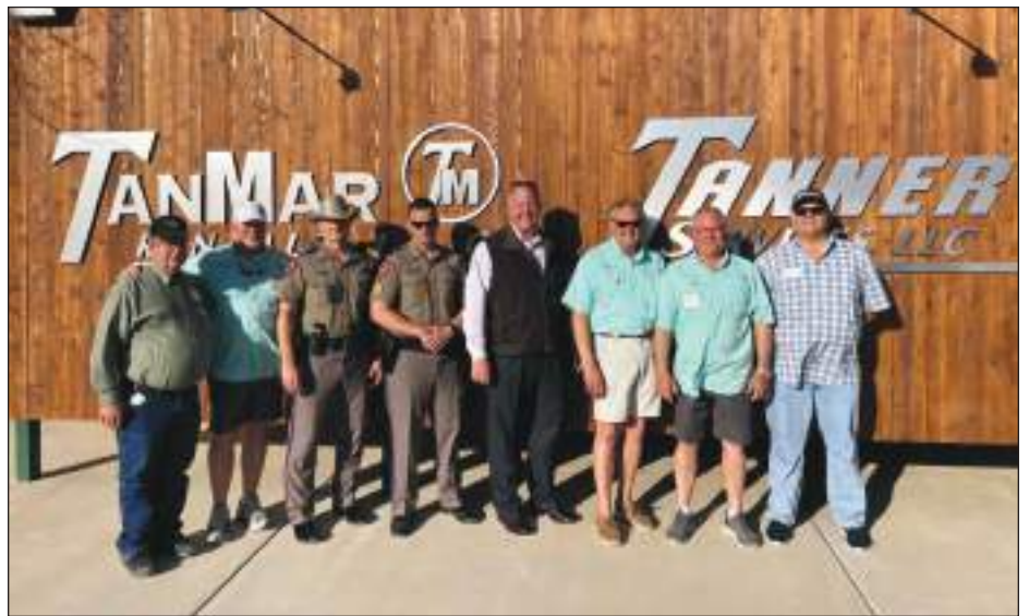
TANMAR, Tanner rentals and Work Designs in Midland hosted a crawfish boil, with a raffle and donated all proceeds to DPSTF.