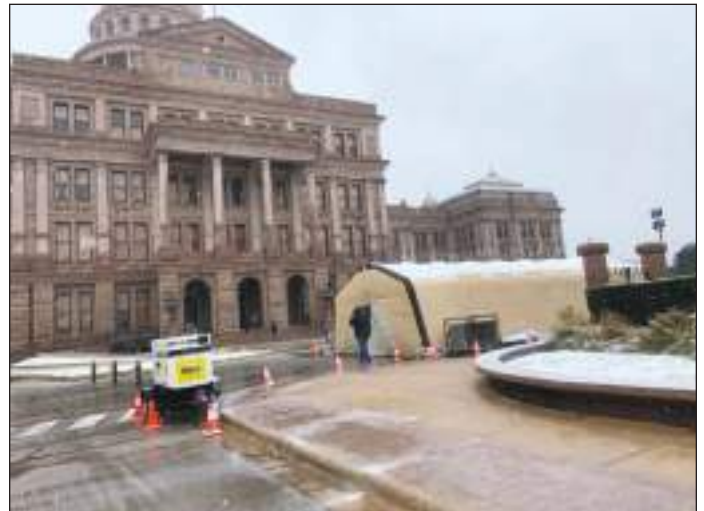
North entrance to the Capitol with the Covid Testing site in place.

are dangerous times. With that, it is also nice to know the Department will be receiving funding to provide ballistic windshields for our patrol units. This is an improvement that has been needed for a long time. Far too many troopers have been shot and killed while still seated in their patrol units. So again, I say thank you to the Legislature for approving the funding for protection provided by the ballistic windshields.