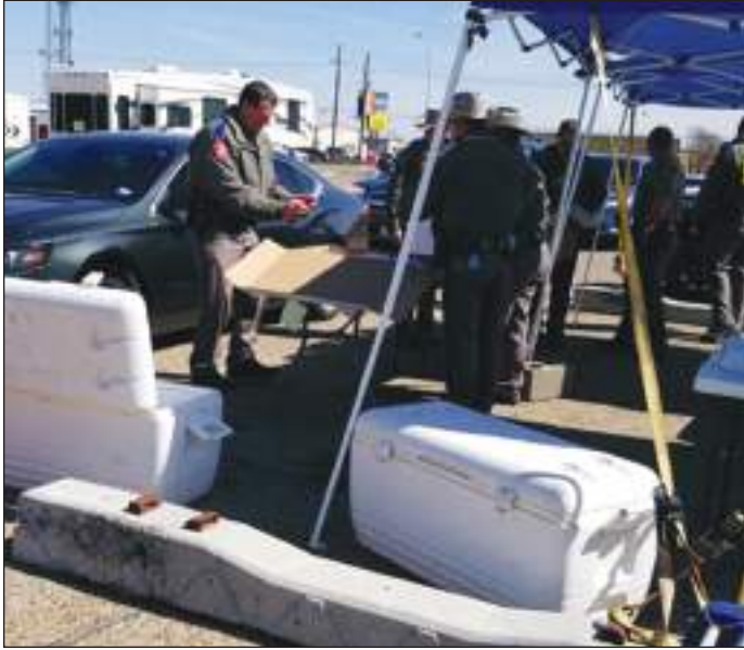
Amarillo DPS Employees Benefit Was a Success Thanks to All of the Help.

completely, and it is easier to ignore it. It is never too late until it is. But when it is too late, it is too late forever.