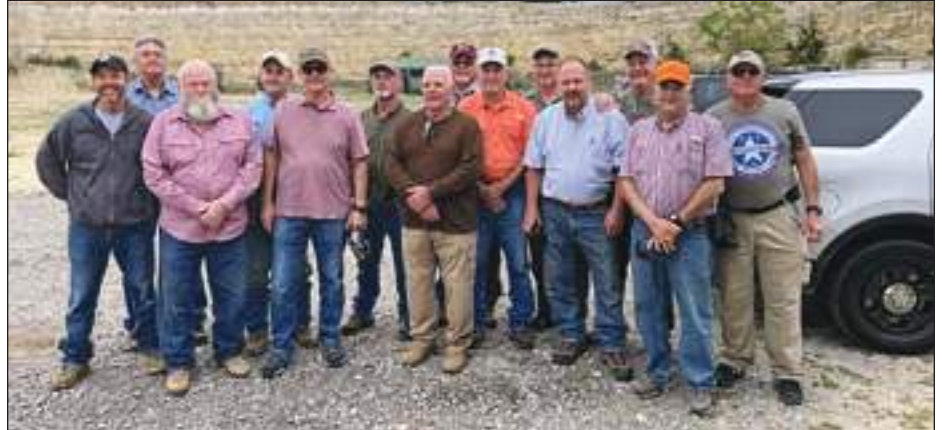
Happy shooters at the Fredericksburg range.