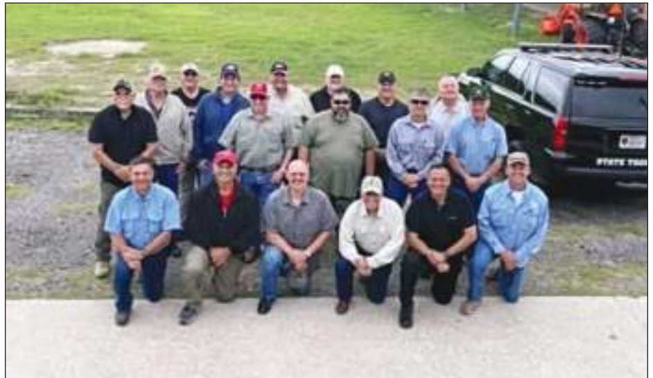
DPS Corpus Christi Retiree Shoot on May 14th, 2021.

Lastly, I want to personally thank all our Legislative team for all their hard work and many, many hours