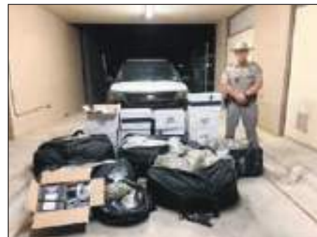
415 lbs of marijuana from traffic stop for speeding on US 285.