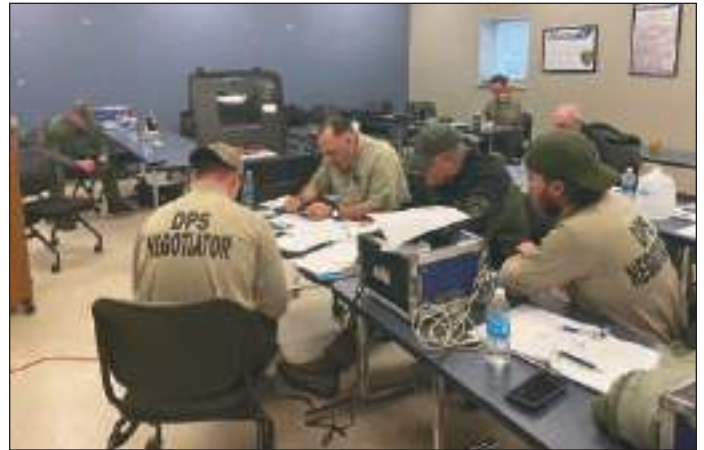
Region 5 CNU Training with WFPD – Feb. 2022.

Having been a part of region 5 is one of the best parts of my career. There is no cop job better than being a Trooper. The closer I get to the beginning of my civilian career (around the 1st of October), the more I realize there won't be any more manhunts, pursuits, deployments, task forces, tactical training, or unique policing activities that