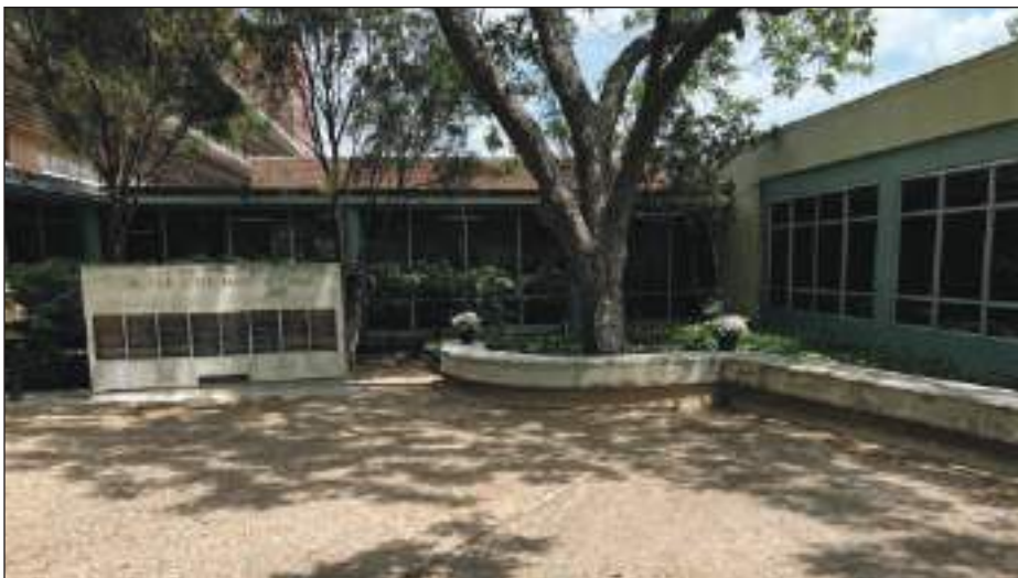
Memorial DPS Plaza.

There is no build date but if you are interested in becoming a donor, please email info@texasdpsoa.com .