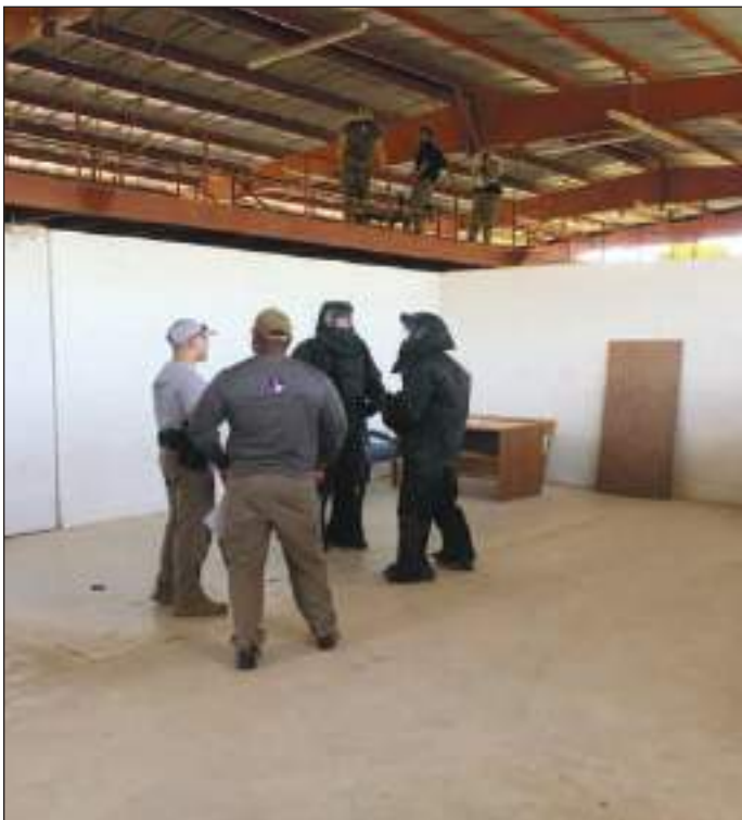
TASER training A-2022.