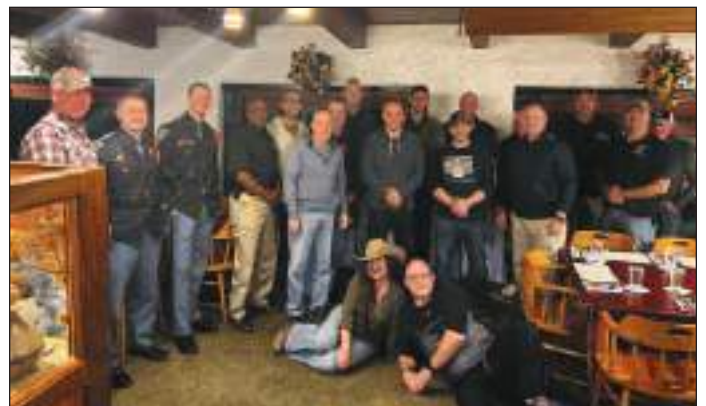
Honor guard in El Paso.

After you have entered your phone number, you will receive a 6-digit code via SMS on your mobile phone. Enter that code in the app and that is it!