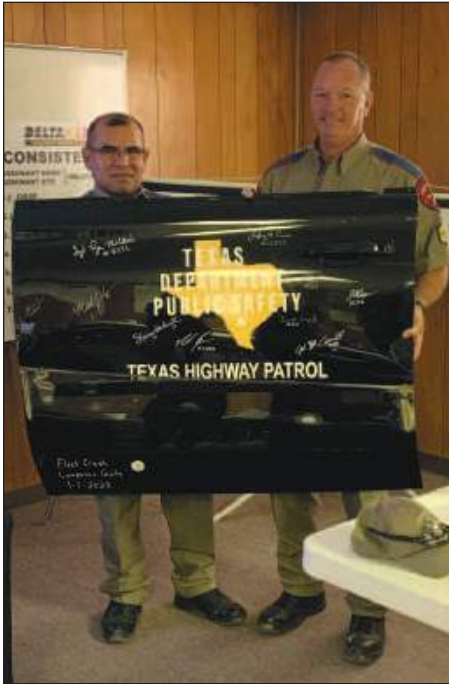
Fleet crash award.