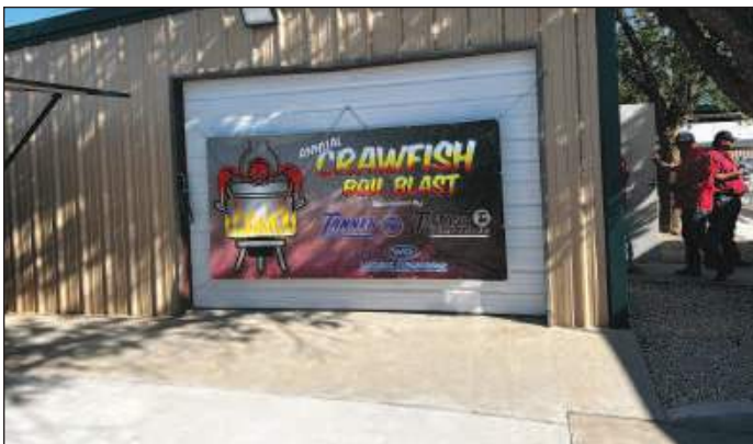
Midland Fundraiser by Tanner Industries