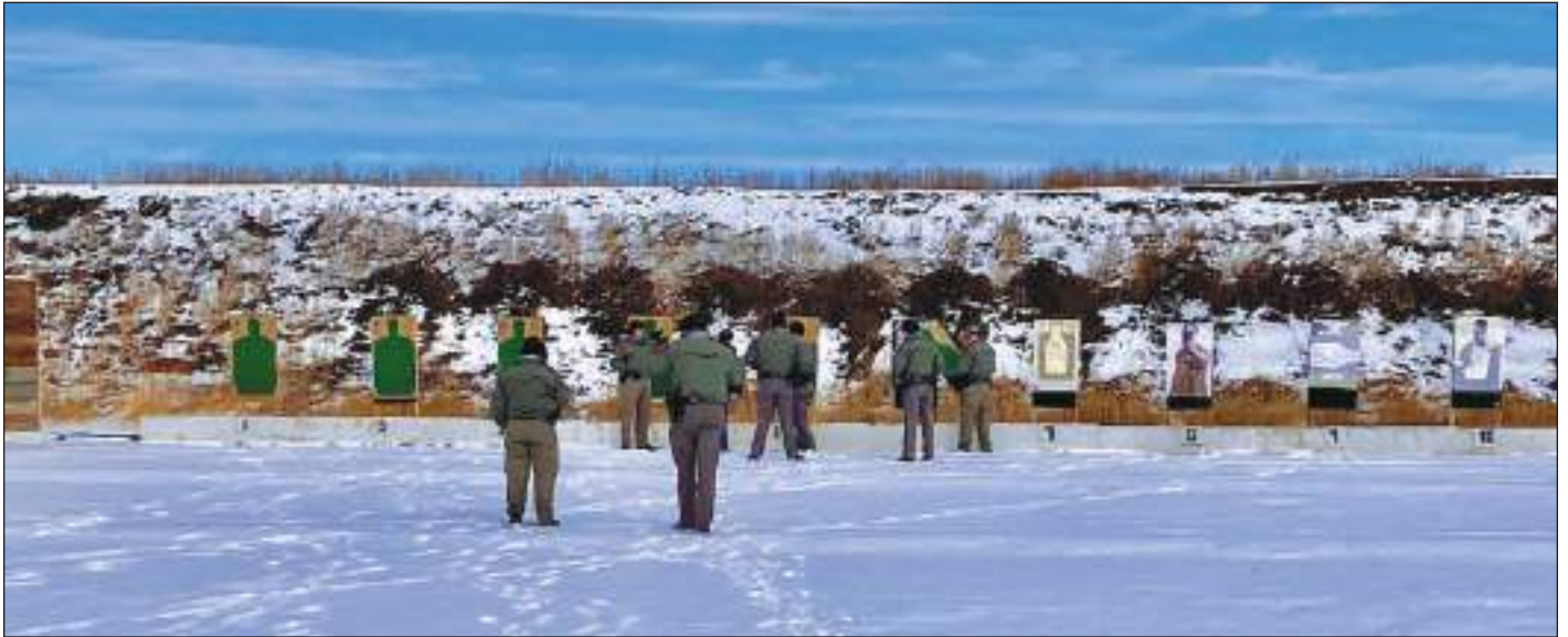
5B Off Duty Pistol Qualifications.