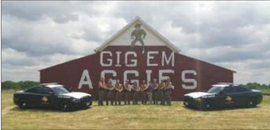
A long tradition.