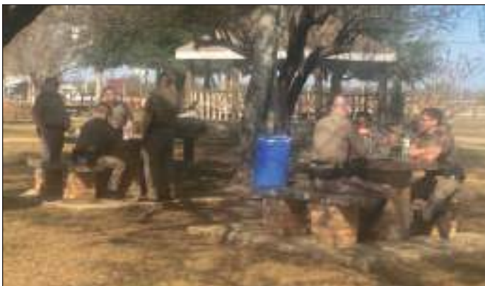
Southeast Texas Troopers taking a quick meal break while working Operation Lone Star near Carrizo Springs.