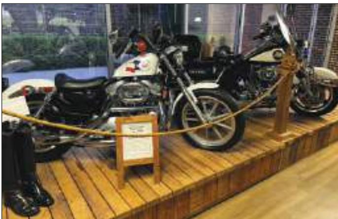
Fleet motors on display at DPS.