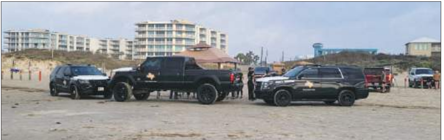
DPS Representing at the Chad Walker Memorial Beach 5K.

bringing those signs to the roadways. Funding for bullet resistant windshields was also something that DPSOA helped to secure. Most importantly, the Daniel Shown Bill, SB1071, was passed with exclusive work from DPSOA to ensure Troopers who are injured in the line of duty are able to medically retire at the highest salary for schedule C. DPSOA is the only agency lobbying exclusively for the DPS employee.