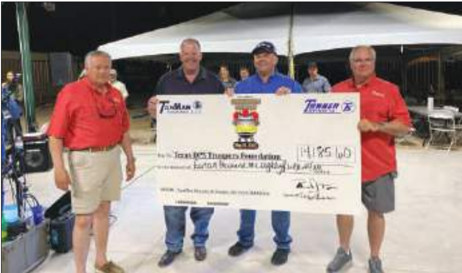
DPSTF receives $14k donation.