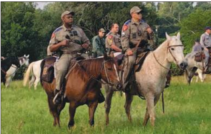
Southeast Texas Region troopers working during the TDCJ manhunt near Centerville.