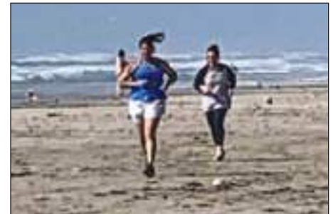
Region 5 Communications at the Chad Walker Memorial Obstacle 5k Beach Run.

There are a lot of things about this job I know I could do much better if I had the opportunity to go back. There are even more things I am grateful for.