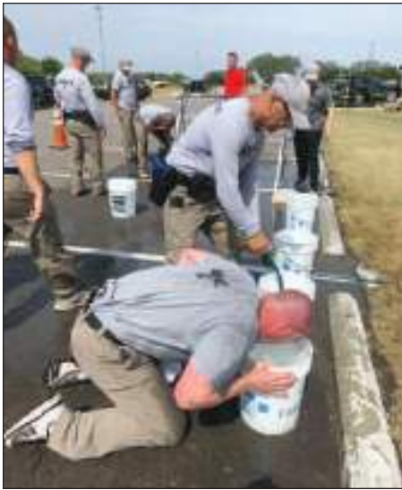
OC training A-2022.