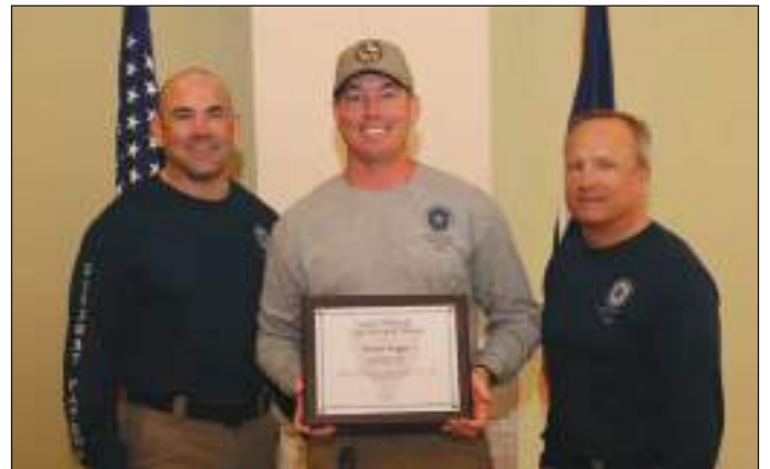
Trooper Topper, Archer City, 2023 Top Trooper.