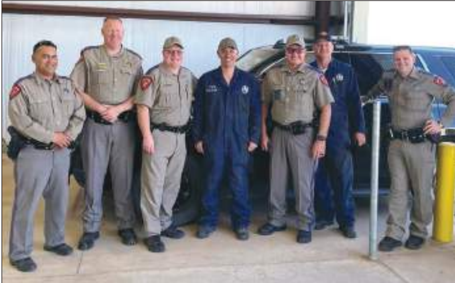
Roadcheck 2023 Amarillo.