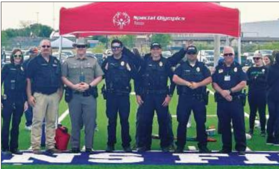
Special Olympics event held at City View High School.

ing. These teams are a highly dedicated group of law enforcement officers representing organizations across this great nation and Canada. They converge on the Nation's Capital yearly for National Police Week, where peace officers are honored for their dedicated service to protecting our communities.