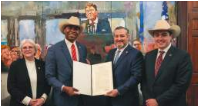
Senator Cruz recognizing Rangers in the US Senate.