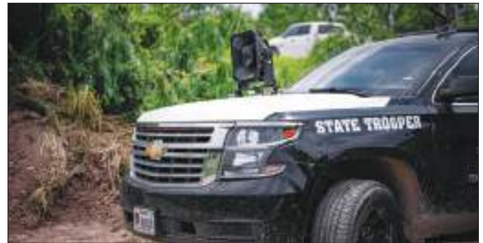
Conducting International Diplomacy.

Now, let's turn our attention to the main event that has been making headlines and buzzing in the news: the discussions surrounding Texas DPS and TMD and the topic of Title 42, particularly its impending end. You may have come across posts on social media showcasing caravans of black and white patrol vehicles making their way towards the Texas border, spanning over 1200 miles from Brownsville to El Paso, and every point in-between. These Troopers symbolize a collective effort to rein-