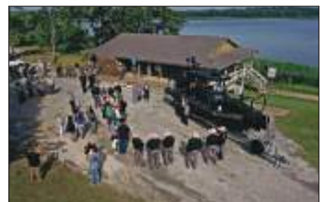
Damon Allen Tactical Marine Unit Dedication.