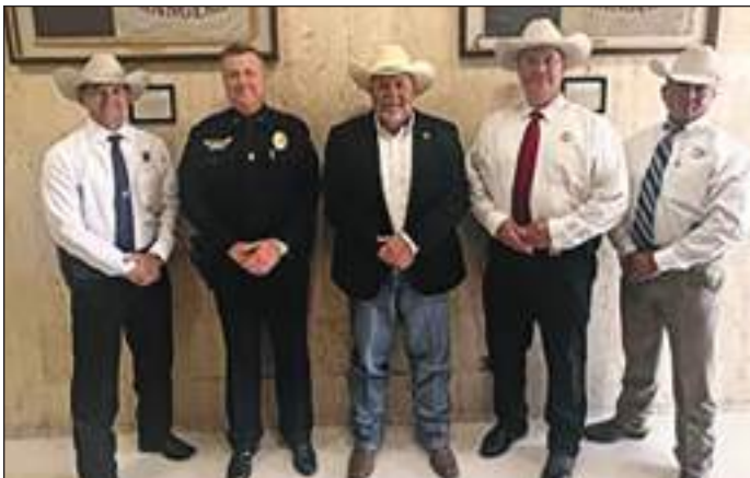
Flag dedication ceremony at Victoria.