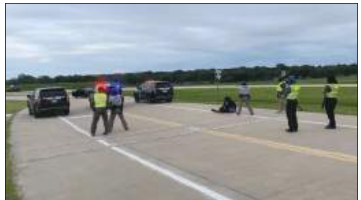
Class C-2022 JTFX Training at Florence.