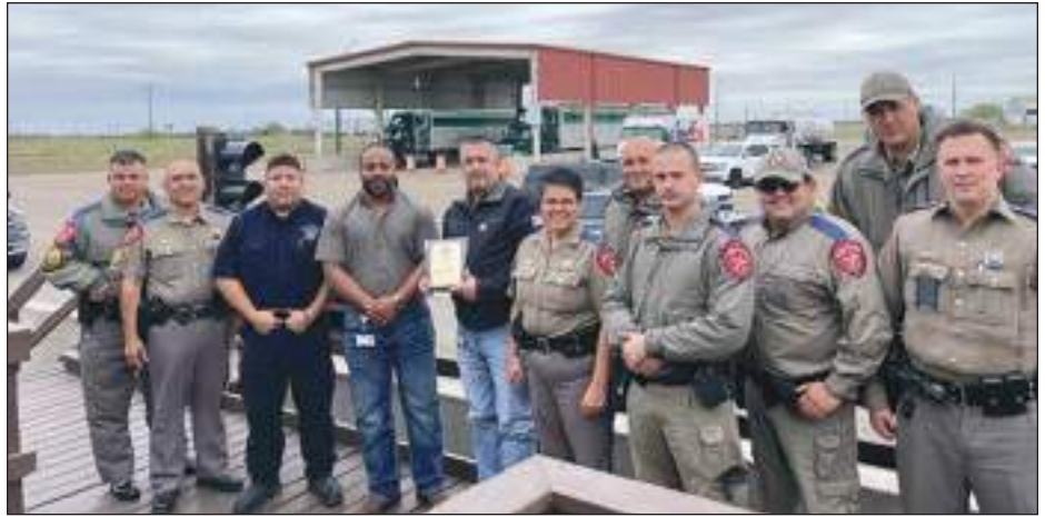
R & L Carrier appreciation plaque.

The DPSOA store has recently introduced some amazing features that are sure to enhance your shopping experience. If you've ever visited our store, you've probably noticed the new and innovative additions we've made.