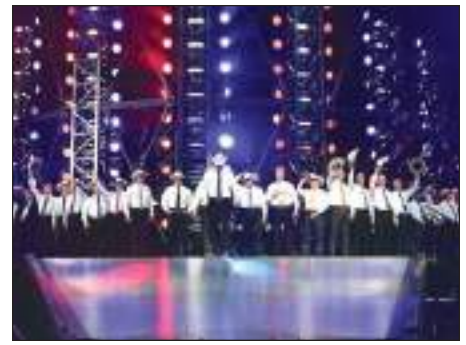
Rangers recognized at the Houston Live Stock Show and Rodeo.