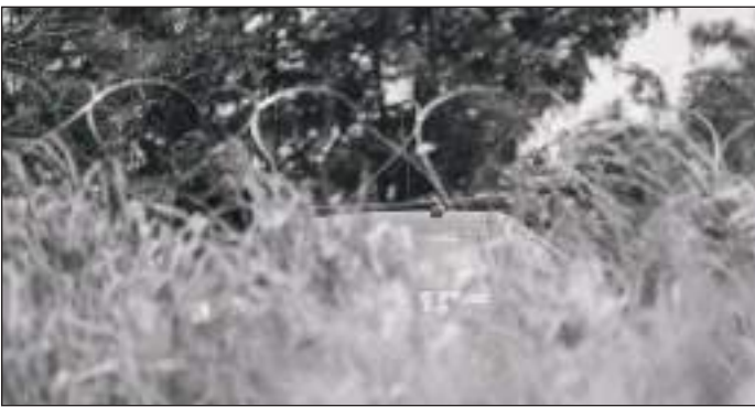
Hidden Trooper on the River.

force and secure the border, a crucial task that captures the attention of the nation. The presence of these Troops serves as a visual representation of the dedication and commitment shown by the authorities to address the challenges and complexities associated with border security. It is an unmistakable sign that significant efforts are being made to safeguard the integrity of the border and ensure the safety of the communities that reside within and alongside it.