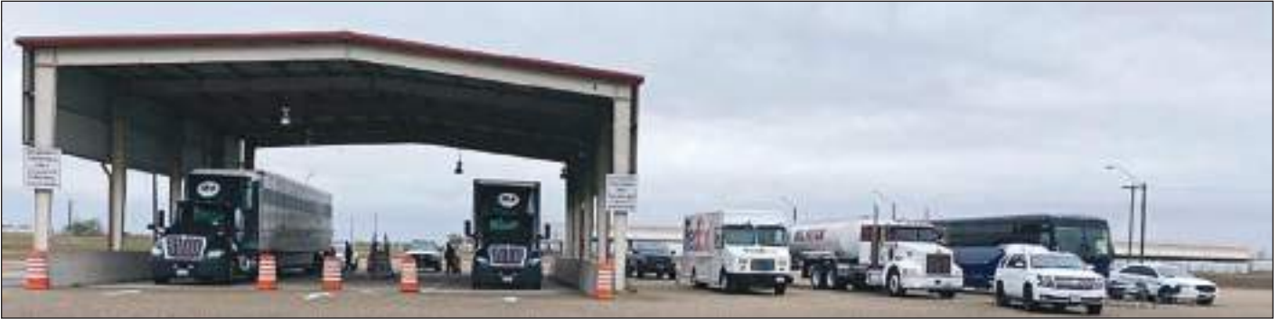
2023 Region 3 Challenge staging area Los Indios.