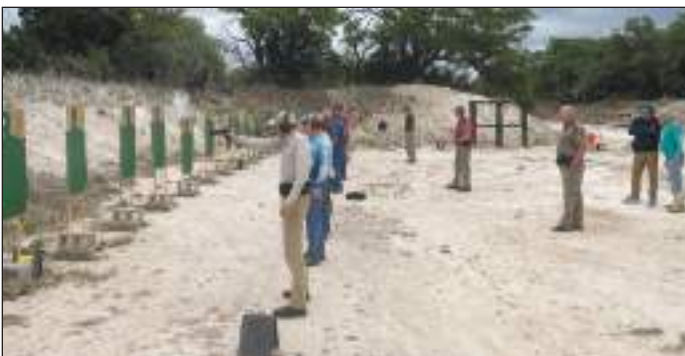
Retiree Qualification in San Saba.

November 7, 2020. There was a 15.2 percent increase in traffic fatalities from 2020 to 2021, when 4,489 people died in traffic crashes. We, as a Department, can do our part to “End The Streak” by being visible, patrolling the highways and bi-ways across the State, stopping violators when we have the chance.