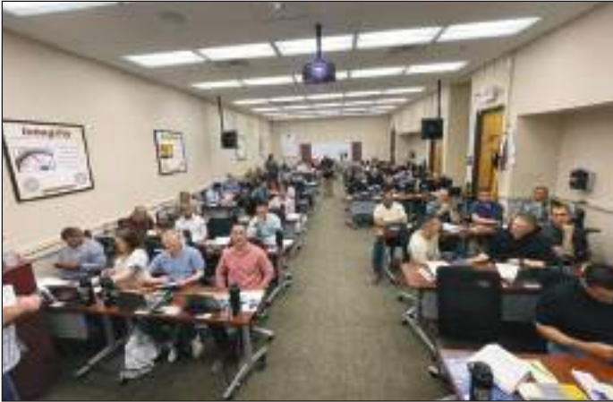
Class C-2022, one week before graduation, getting briefed on DPSOA Membership.