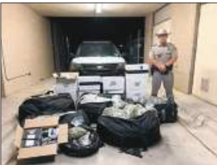
415 pounds of Marijuana seized on U.S. 285.