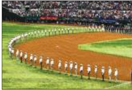
Globe Life field in Arlington.