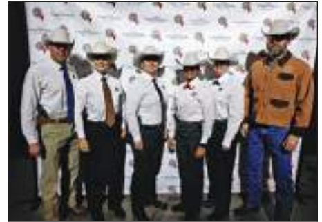
Rangers at the National Cowgirl Museum Hall of Fame in Ft. Worth.