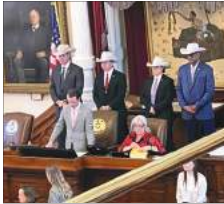
Rangers recognized in the House.