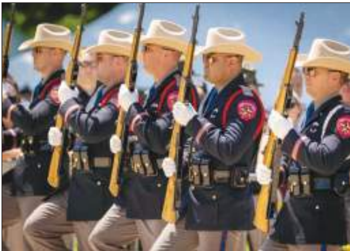
Texas DPS Drill Team wins First place and receives the Steve Young Honor Guard Award.