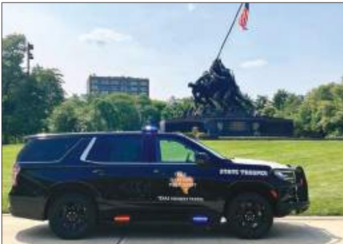
Texas DPS Drill team at Iwo Jima Memorial Monument in Arlington, VA.

On April 28, 2023, the Crime Victim Coalition of West Texas honored individuals during their 2023 Awards Ceremony for going above and beyond serving victims of crime in our communities.