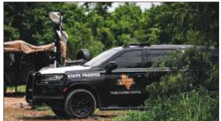
New Color Schemes.