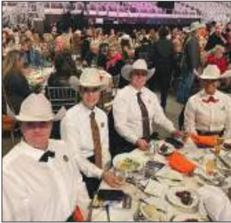
Bicentennial event dinner.