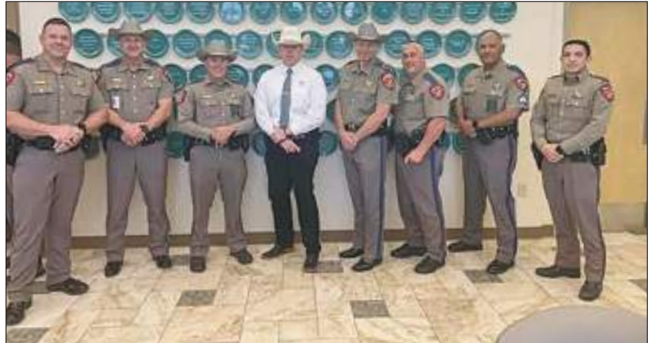
NW Troopers and Ranger delivering lunch to local Lubbock citizens for Meals on Wheels organization.