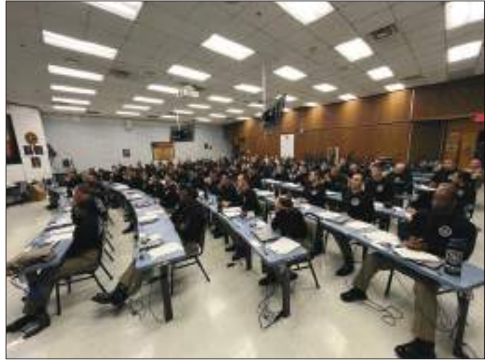
Trooper Trainee Class of B-2023 less than a week from their graduation