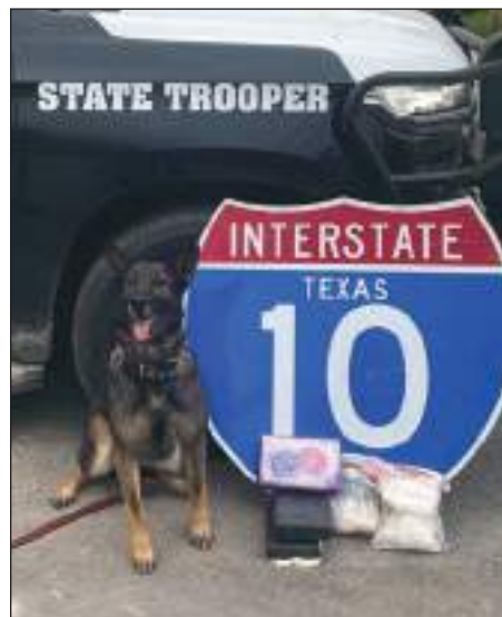
2 lbs. of Methamphetamine a 7 lbs. of Cocaine.