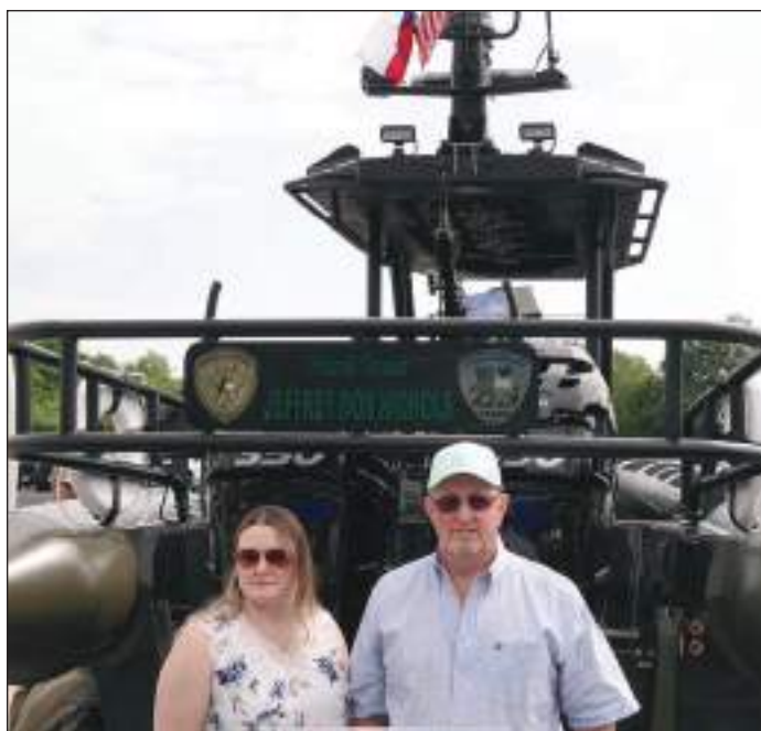
Patrol vessel Jeffrey Don Nichols