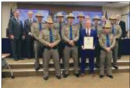
5A11 awarded a Unit Citation for the amount of narcotic and illegal item seizures