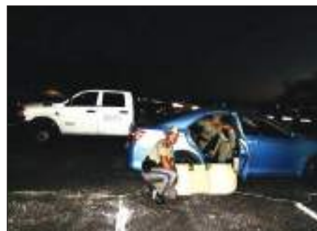
5 lbs. of Cocaine