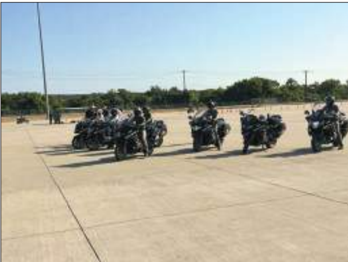
DPS Motor Unit Open House at Florence

The Department has a Fitness and Wellness Unit in Austin that has been in action since 2010. The Fitness and Wellness Unit has the mission of changing lives for the better to help prevent heart and obesity related diseases through training and education of the members of the Department. In conjunction