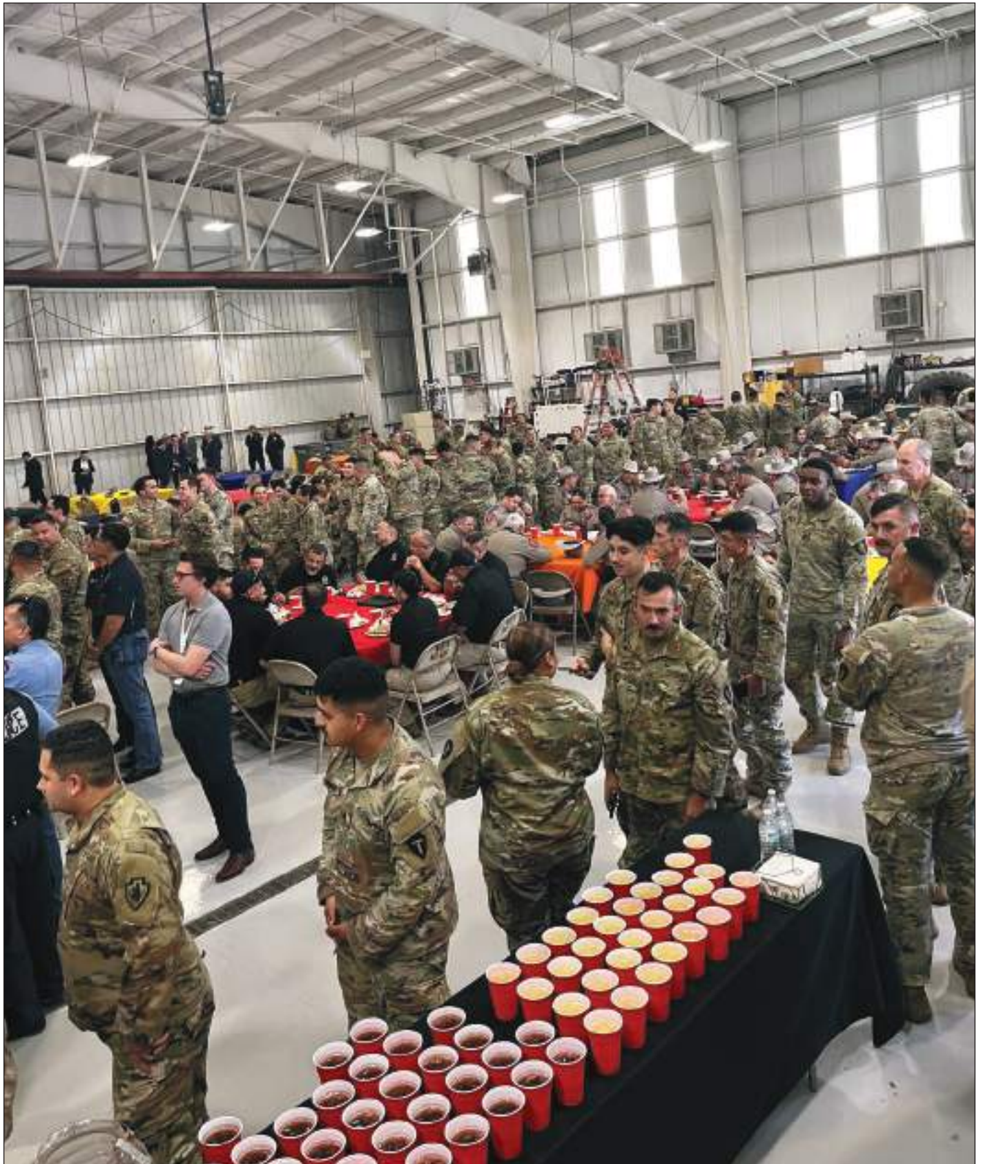
Feeding troops at Edinburg