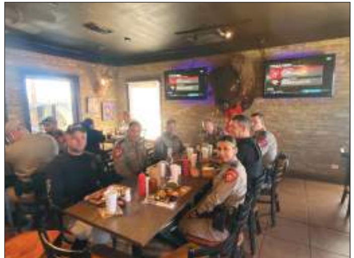
Eagle Pass Thanksgiving meal