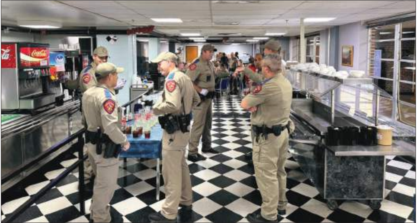
VCTF Austin Thanksgiving meal