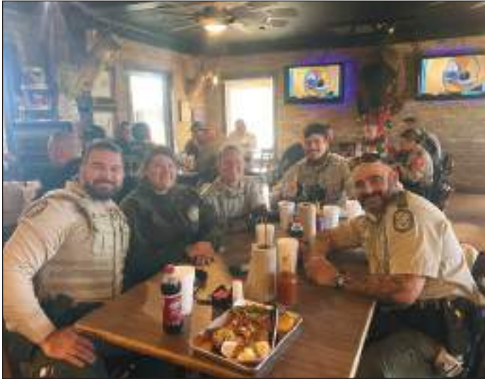
Eagle Pass Thanksgiving meal