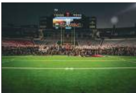
DPS Lubbock HP and CID participate in the 911 Memorial Stair Climb.