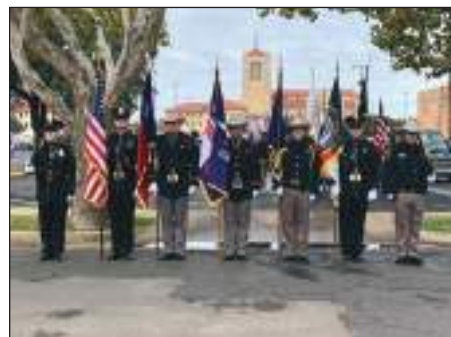
NW Honor Guard