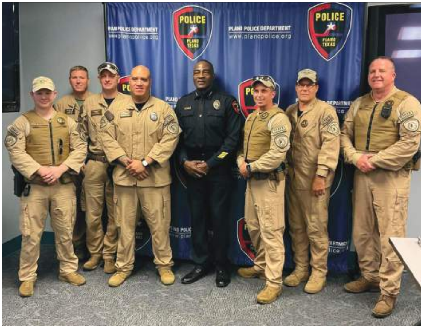
Dallas Air crew