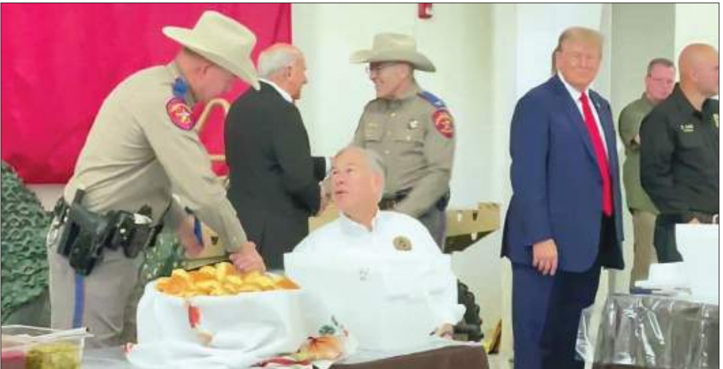
Thanksgiving meal for all Law enforcement and military working the border in Edinburg with Governor Abbott and President Trump