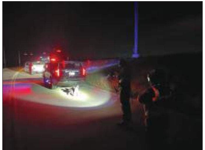
High risk training for C23 class