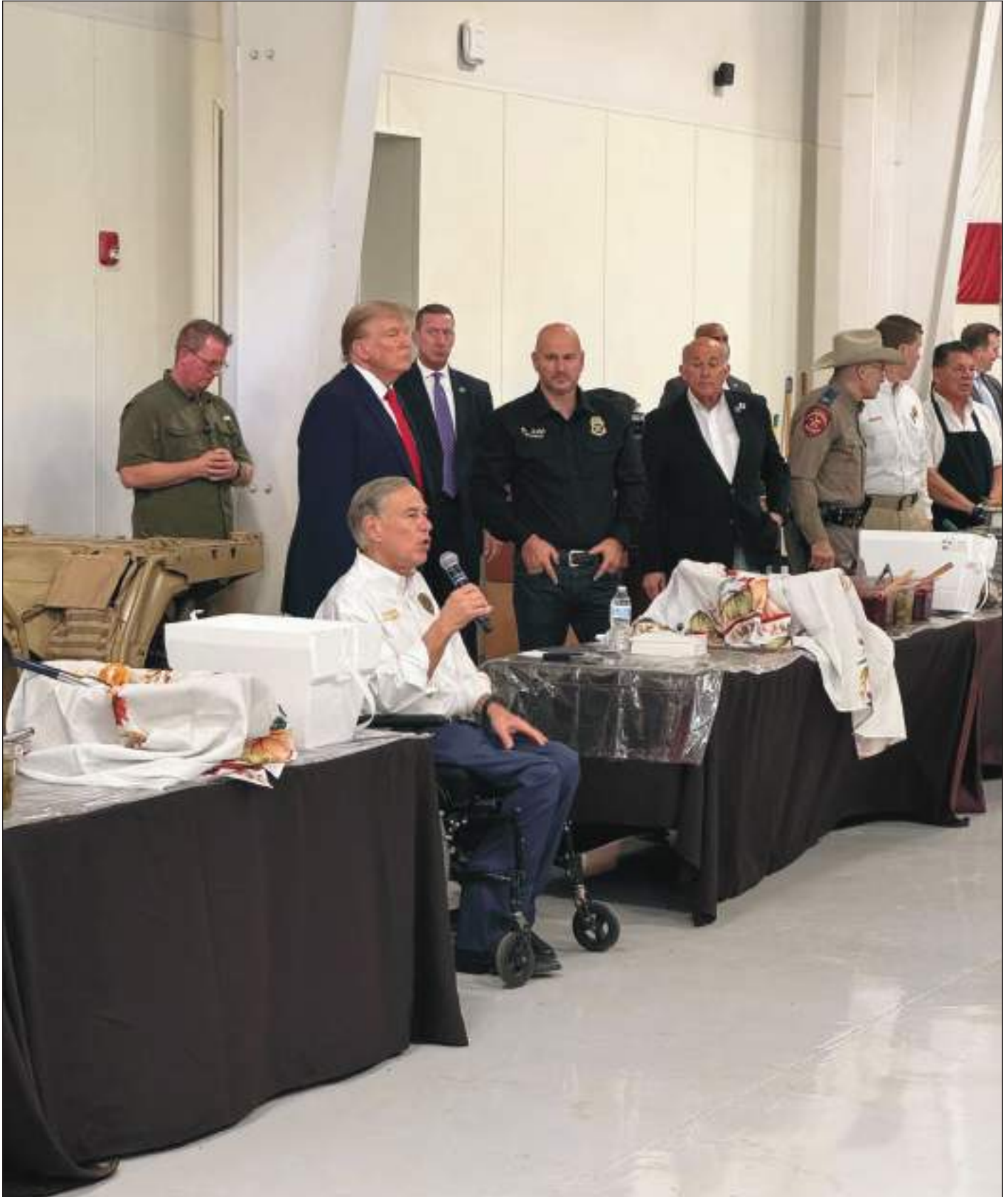
Governor Abbott addresses the group at the Edinburg thanksgiving meal