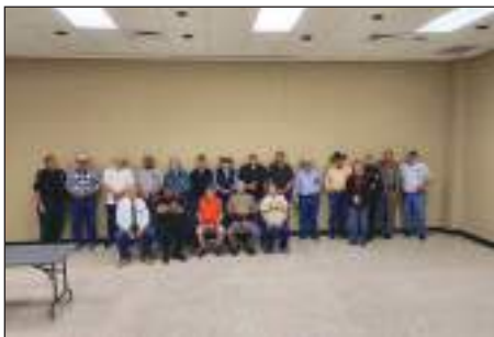
5B3 reunion luncheon