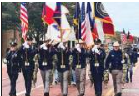
NW Honor Guard with Lubbock Regional Color Guard at the Veterans Day Parade