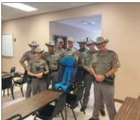
Child Safety Seat training in Ft. Stockton