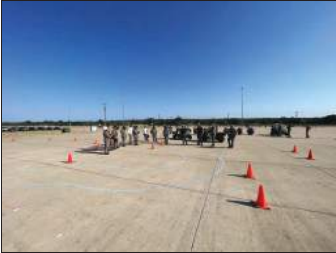
Training at Florence