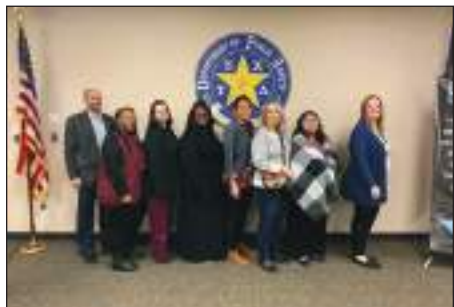
Lubbock County Crime Victim Coalition (LCCVC) Conference held at DPS Lubbock Regional Office.