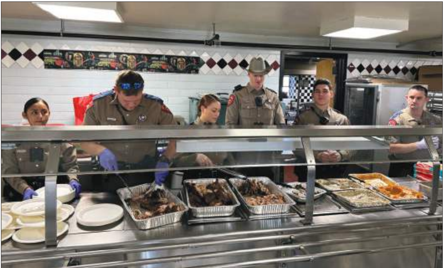
VCTF Austin Thanksgiving meal