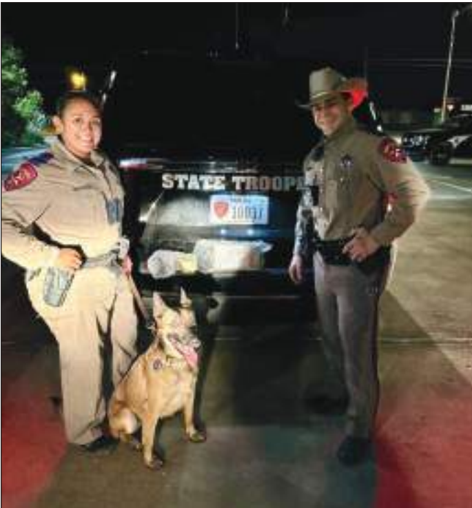
2 lbs. of Cocaine

Regarding mental and emotional wellbeing, when logging into the texasdpsoa.com website, you will now notice a new category "VESS SERVICES." Employee Support Services (ESS) offers comprehensive stress management services to Department employees to promote the employee's process of achieving resilience to work-related or personal adversity and assist employees in their responsibility to maintain themselves in good physical and mental condition to perform their job duties effectively. All ESS services are confidential. Team members, including the licensed behavioral health staff, chaplains and employee peer support volunteers will not reveal information shared with them by