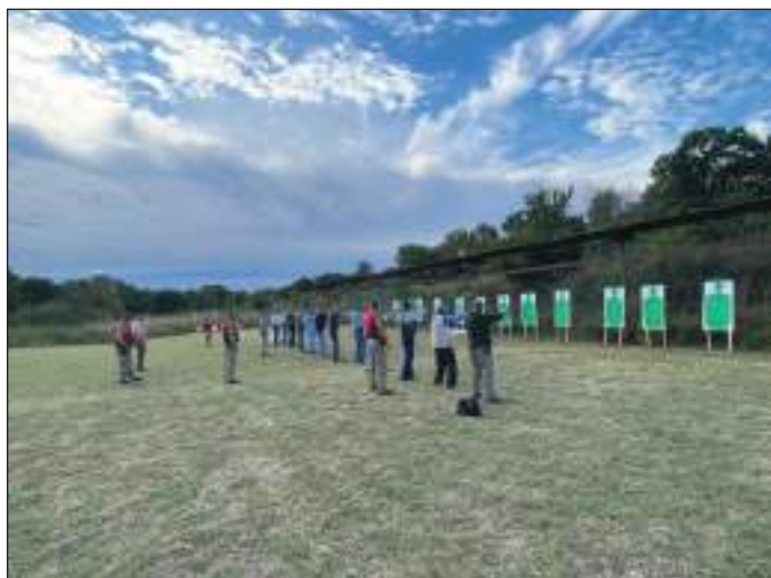
Retiree firearms training Waco