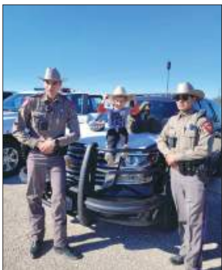
Touch a truck in Ozona