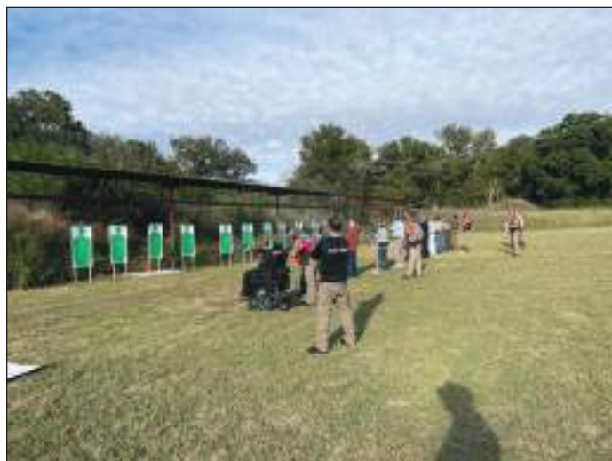
Retiree firearms training Waco