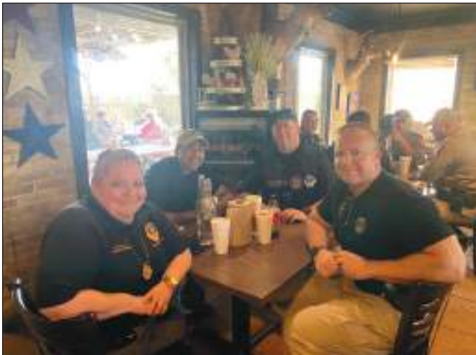
Eagle Pass Thanksgiving meal