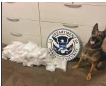
Remembering Canine "Loko"