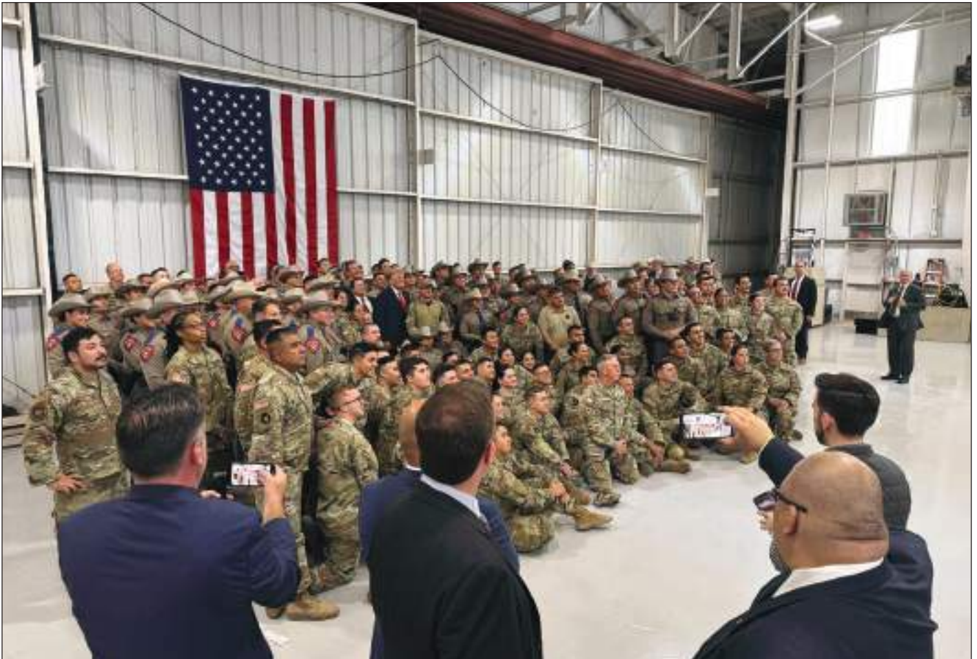
Thanksgiving feed in Edinburg