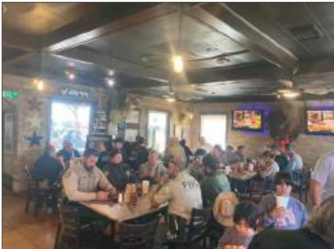
Florida Troops at Eagle Pass Thanksgiving meal