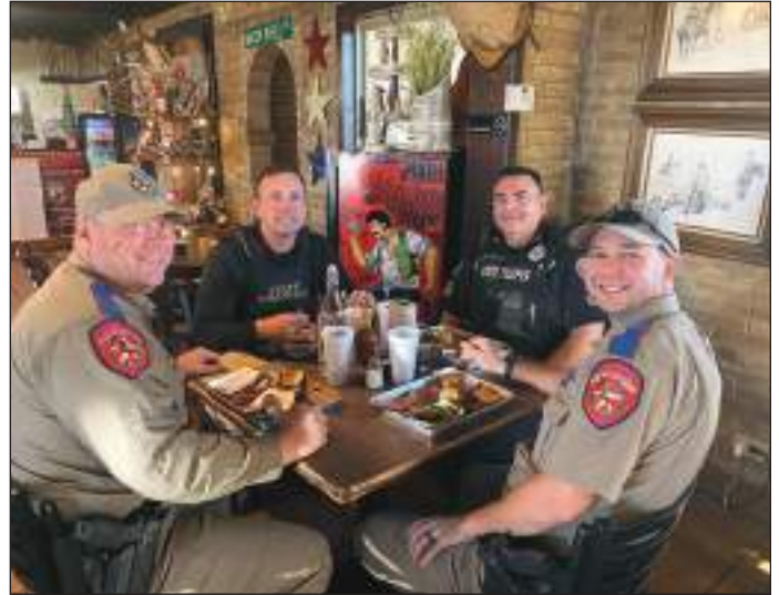
Eagle Pass Thanksgiving meal