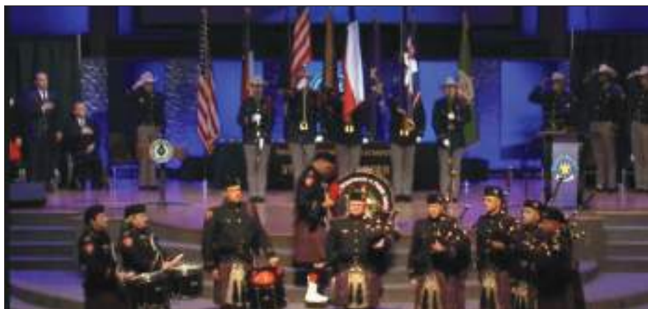
NW Honor Guard at the B-2023 Graduation ceremony

On October 4, 2023, DPS and multiple other agencies participated in National Night Out in various communities