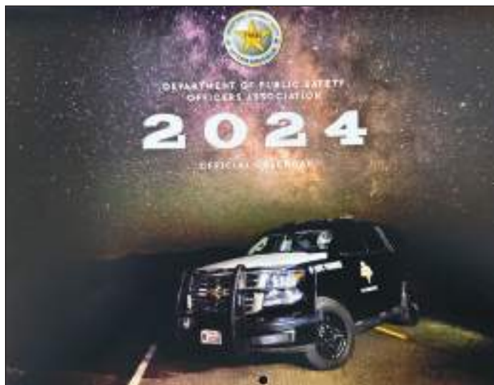
2024 calendar available in the dpsoa store

fed over 800 in those three events. If you are interested in helping support these events, your donations are always appreciated. Texas DPS Troopers Foundation - Donate Now! (firstresponder-processing.com) if you would like to donate online. Remember, your donations are tax-deductible.