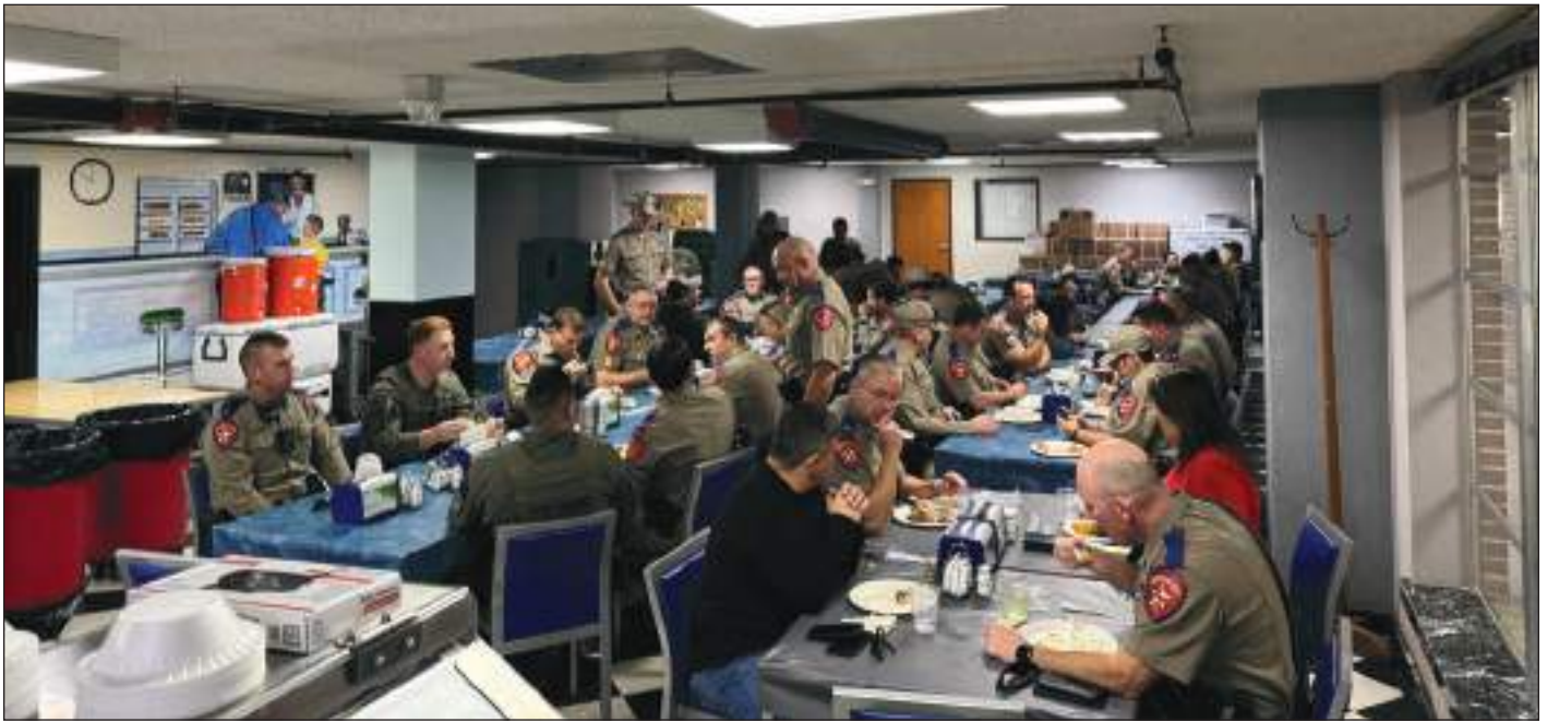
VCTF Austin Thanksgiving meal