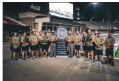
DPS Lubbock HP and CID participate in the 911 Memorial Stair Climb