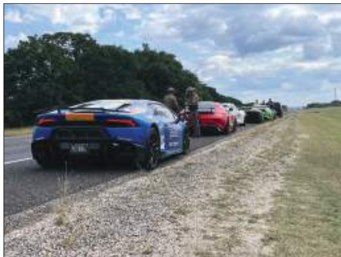
Traffic stop of six reckless drivers racing to COTA from Dallas.