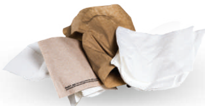
paper towels and napkins (no bathroom waste)