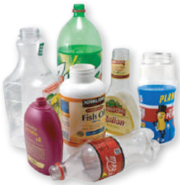
bottles (non-prescription OK)