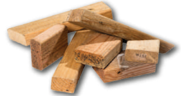
lumber scraps (untreated, unpainted, unstained) (nails - okay)

- No palm fronds, pampas grass, or bamboo -