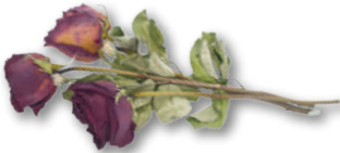
plants and flowers