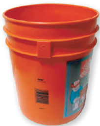
buckets (no handles)