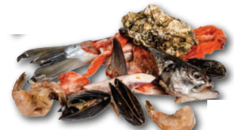
seafood and shells