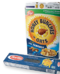
boxes & bags (flattened, nothing waxed or refrigerated)