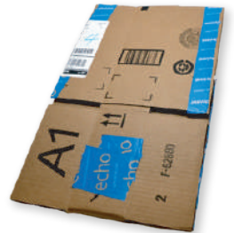
corrugated cardboard (flattened)

Visit thurston.lemayinc.com to view your collection schedule, set reminders, and use the Waste Wizard for helpful tips on disposal.