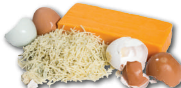
dairy and eggs