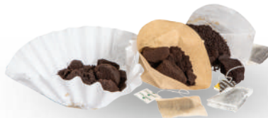
coffee grounds, filters, and tea bags