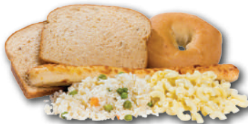
bread, pasta, and rice