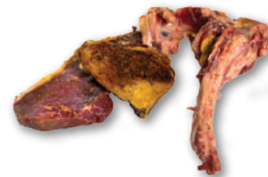
meat and bones