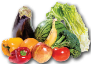
fruits and vegetables