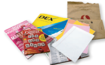
mixed paper & empty paper bags