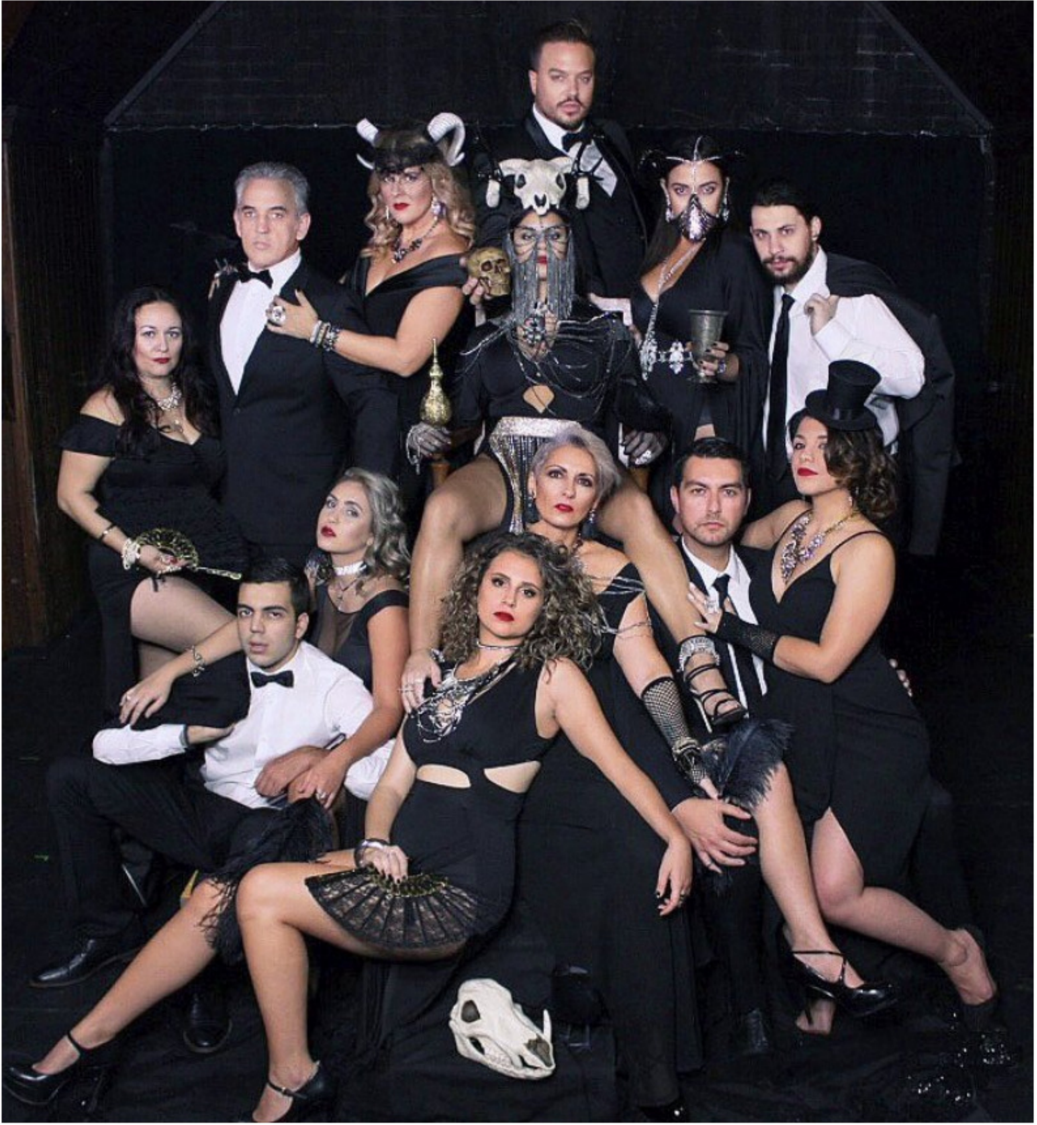
The cast of Oi Erosyilies , the third Greek theatrical play produced by Ten Tone Productions.

While racy in subject matter, in foundation it’s about love and the sacrifices that women have to make between different types of love for family, virtue and other ideals that the society expects of them. Similar to the previous two, it’s based around a strong female character.