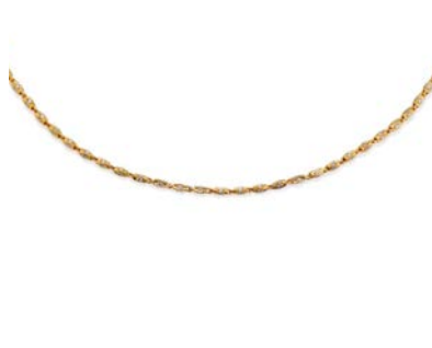
The Mother Chain