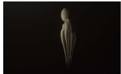
Keep your Tentacles to Yourself