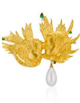
The Angel and The Devil

To discover the world of Authorne, please visit www.authorne.com .