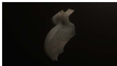
The Mother Chain