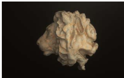
Heed the Guardians