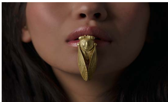
Cicada brooch. Antique gold, diamonds, and emeralds.

Cocktail Reception: Tuesday, September 19, 5-9PM