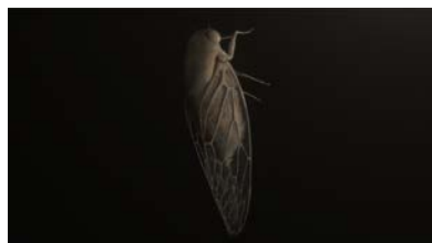
Cicadas Sing a Rare and Different Tune