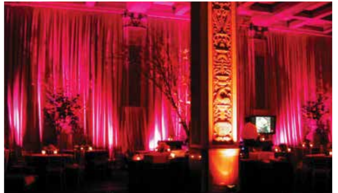
ADDITIONAL ROOM LIGHTING