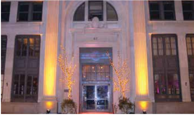
EXTERIOR COLUMN LIGHTING

Product selection and availability cannot be confirmed until a 50% deposit is paid to reserve the items for your event. The final balance will be due 30 days prior to your event for any specialty items.