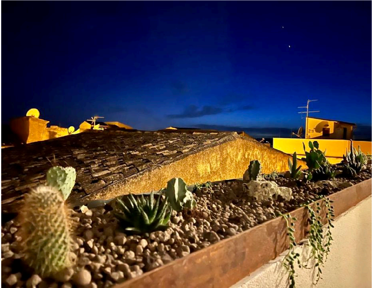
View from The Terrace at The Rooftop.