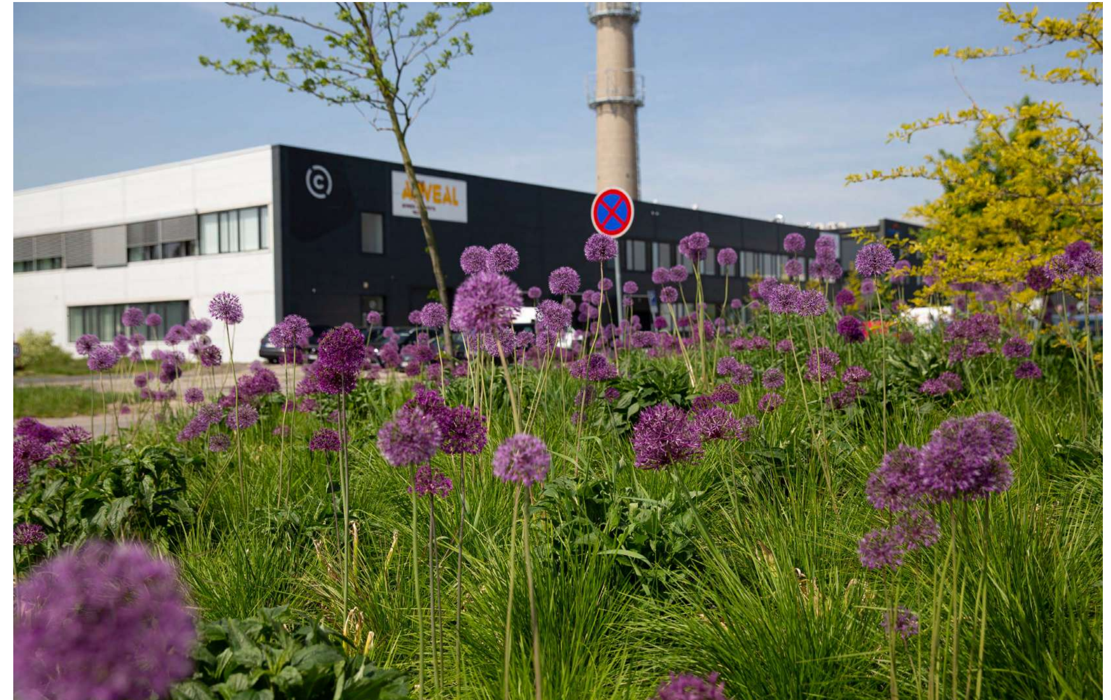
Contera Park Říčany