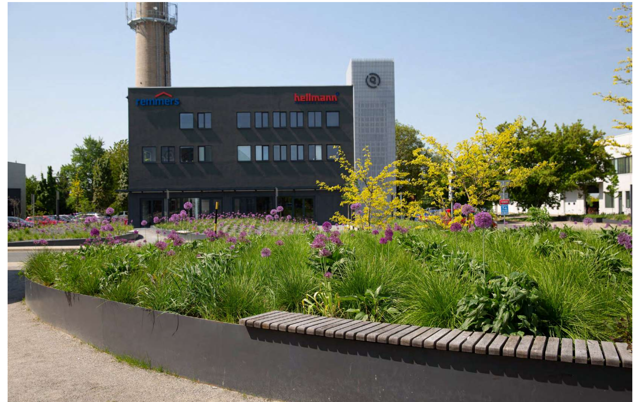
Contera Park Říčany