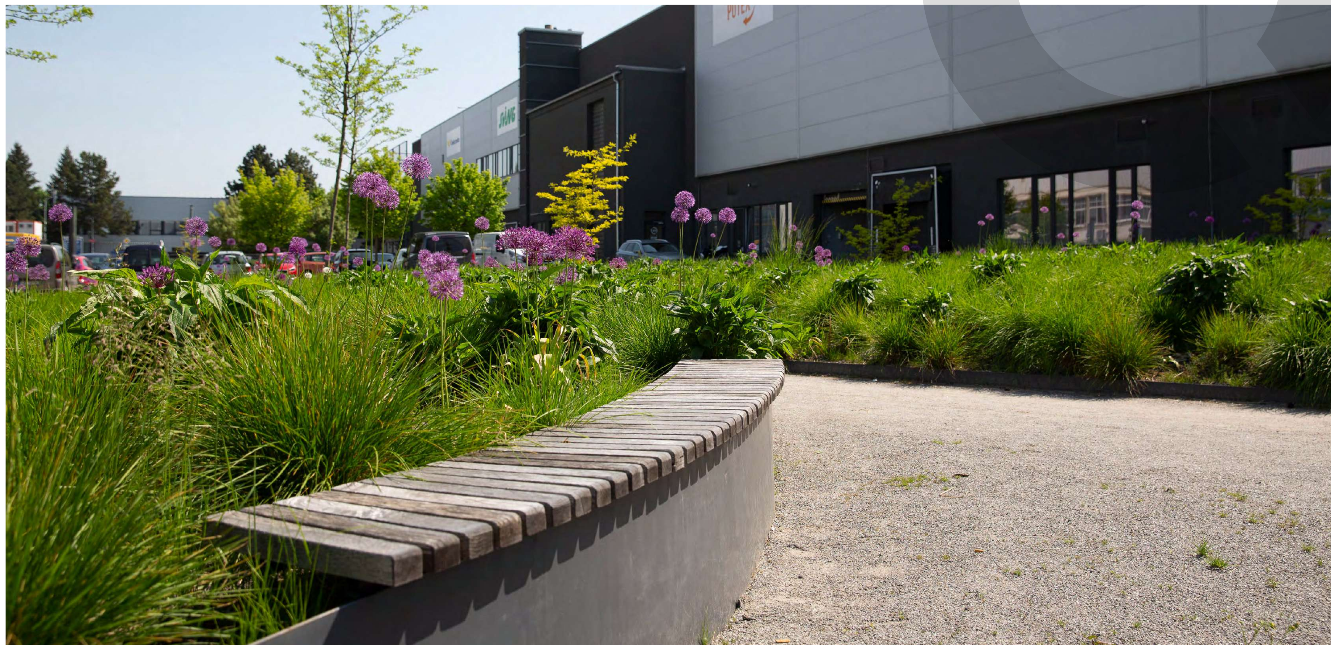
Contera Park Říčany