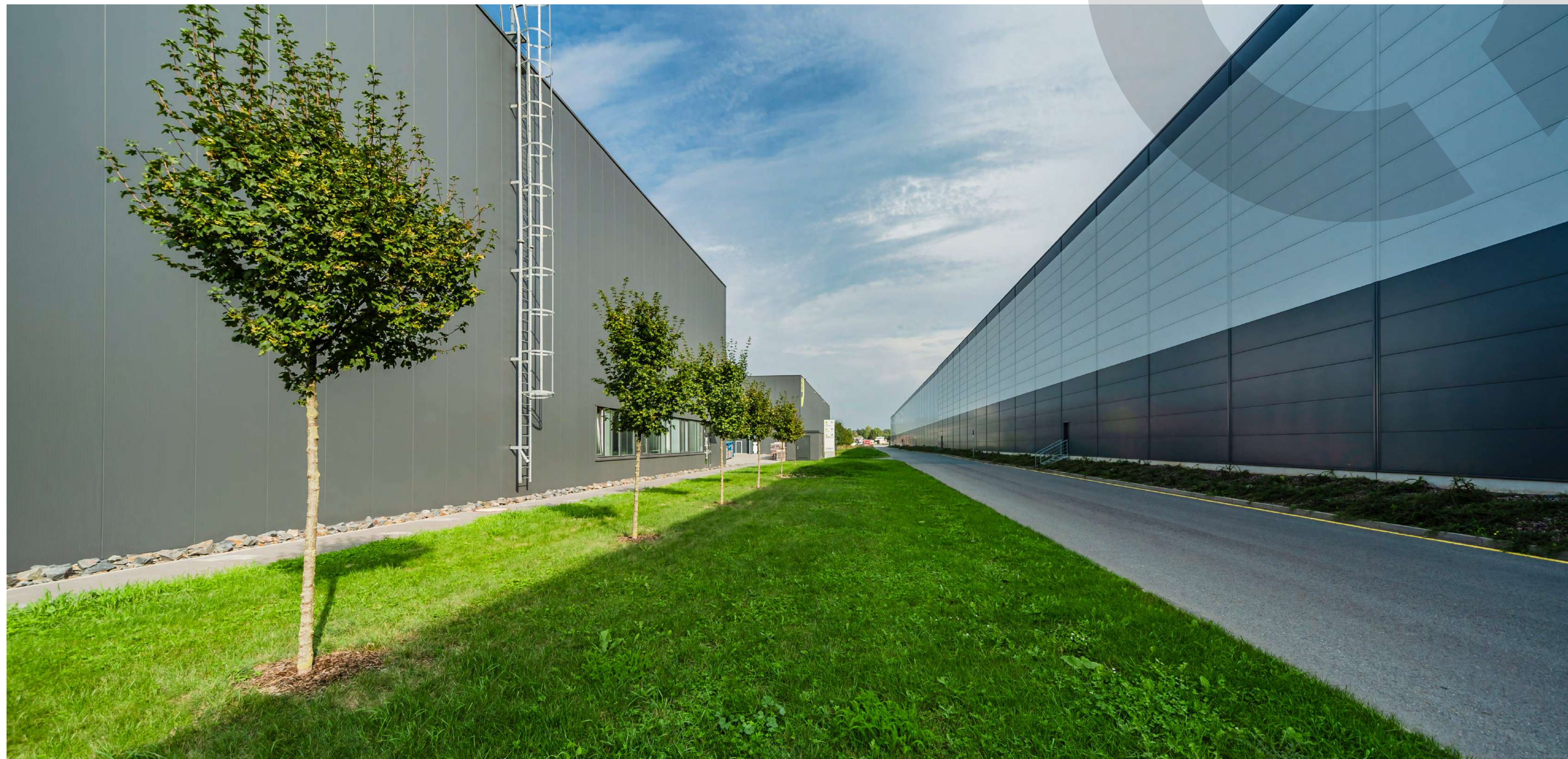
Contera Park Ostrava City