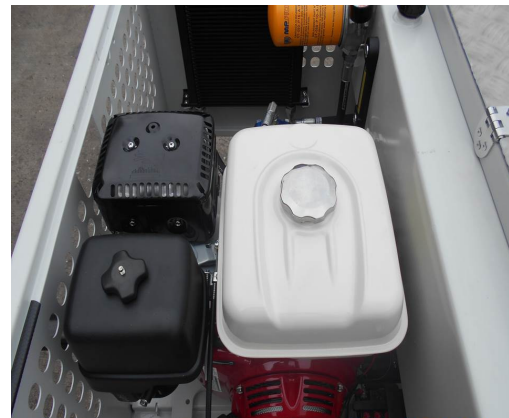
Honda petrol engine