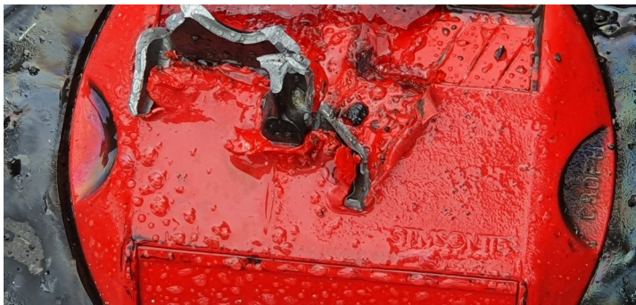
Part of Cliffs bike embedded into a cats eye

Tottenham race course has been booked and the pa-