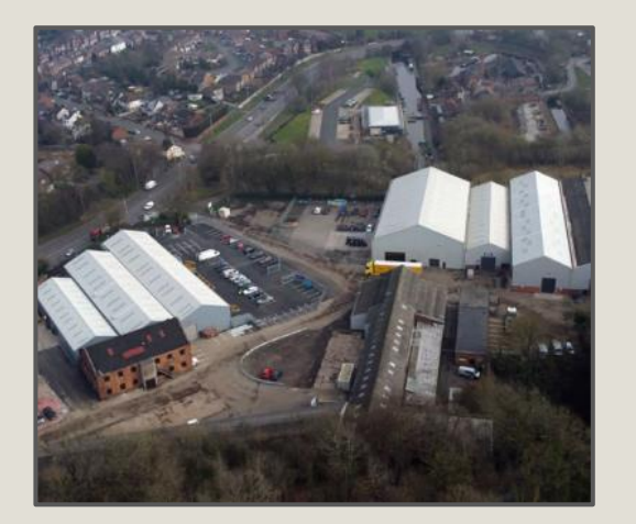
Castle Mill Ind. Estate, Dudley Canmoor Sale - Investment 120,000 sq ft