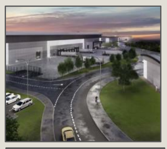
Phase 4 Sheffield Business Park Premcor/Peveril Securities Ltd Development Funding 290,000 sq ft