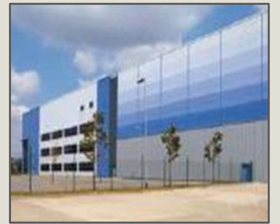
UK Logistics Portfolio Segro PLC Acquisition – Investment

GKN Logistics Park, Bristol Segro PLC Sale - Investment 325,000 sq ft