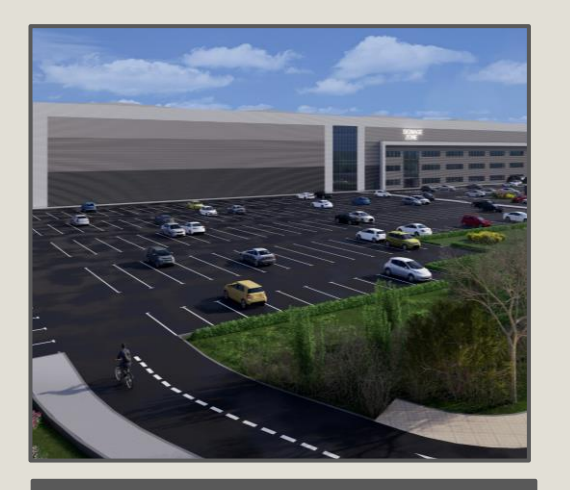
Firth Way, Nottingham Premcor/Barwood Capital Development Funding 370,000 sq ft