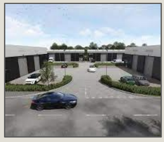
Broadway Park, Yaxley Montgomery Developments Sale – Investment 55,000 sq ft