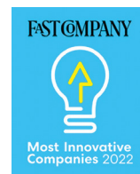
Fast Company Award Most Innovative Companies 2022