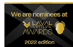
Laval Virtual Awards 2022 Nominee