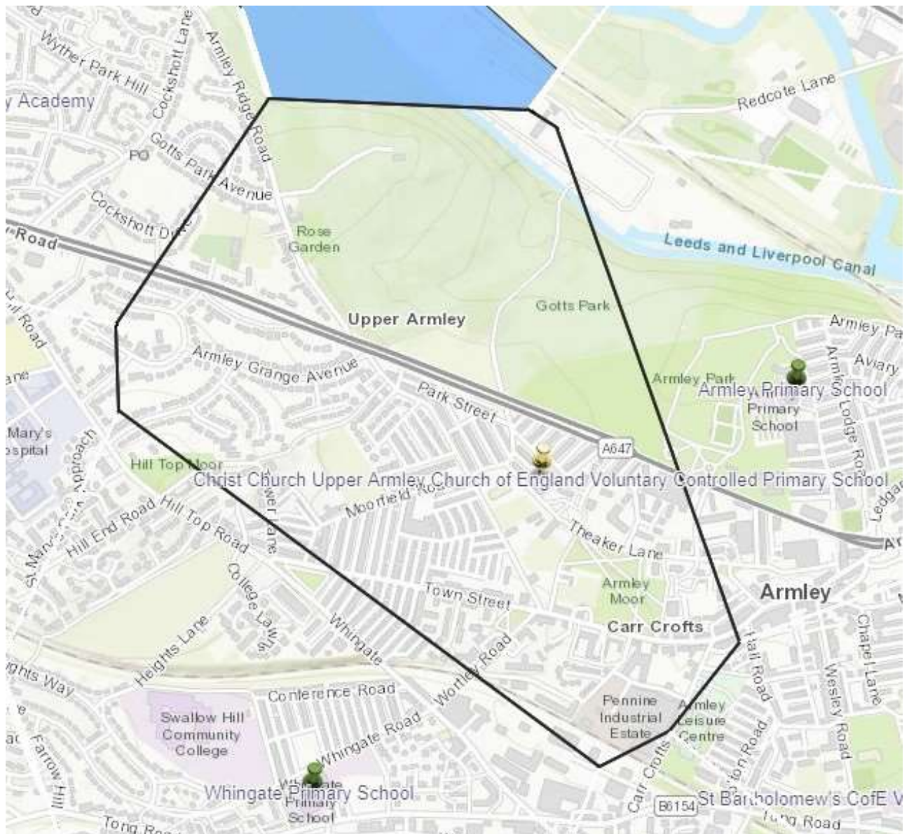
Diagram 1: Catchment priority area for Christ Church Upper Armley CE Primary