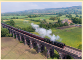
Stanway Viaduct 15 arches, 42 feet above the valley floor

It passes through a 693 yard tunnel at Greet and over a 15 arch viaduct at Stanway.