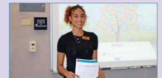
Gridley High School Gridley