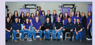
Biggs High School Biggs