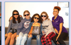
Saving & Spending Program Boys & Girls Club South Lake Tahoe