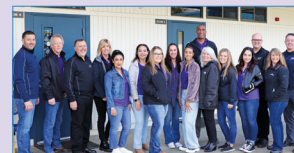
Bite of Reality / High School Program Albert Powell High School Yuba City