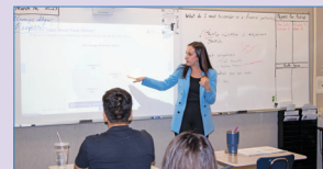
Junior Achievement / Personal Finance Albert Powell High School Yuba City