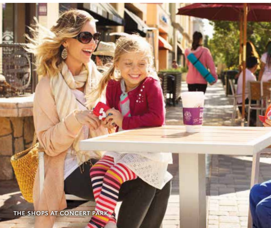
THE SHOPS AT CONCERT PARK