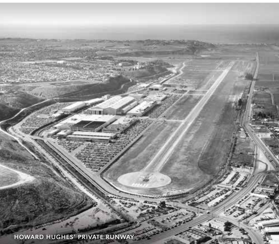
HOWARD HUGHES' PRIVATE RUNWAY