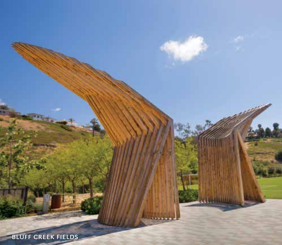
BLUFF CREEK FIELDS