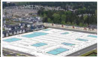
SUNRISE TOWN CENTER