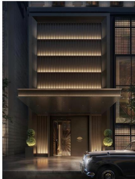
The entrance to the residences, located on Fifth Avenue and 54th Street.

world, hasn't yet welcomed turnkey residences, but Mandarin Oriental is changing that with the launch of Mandarin Oriental Residences at 685 Fifth Avenue, and Forbes has the exclusive sneak peek.