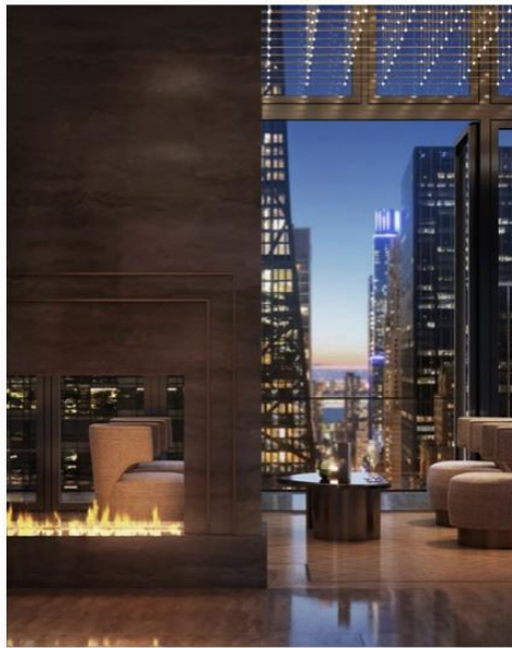
Fireplace in restaurant. SHVO

Shvo mentions that the interiors of the units are extremely oversized, including the bathrooms and bedrooms in specific, adding that the bathrooms feel like your very own “mini spa.