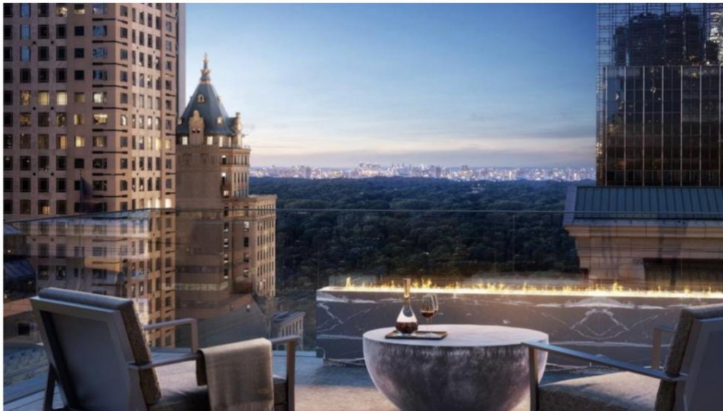
Mandarin Oriental Residences at 685 Fifth Avenue will open in 2022.

You don't even need to bring your toothbrush. If you're moving into Mandarin Oriental Residences at 685 Fifth Avenue , there will be a branded one waiting for you.