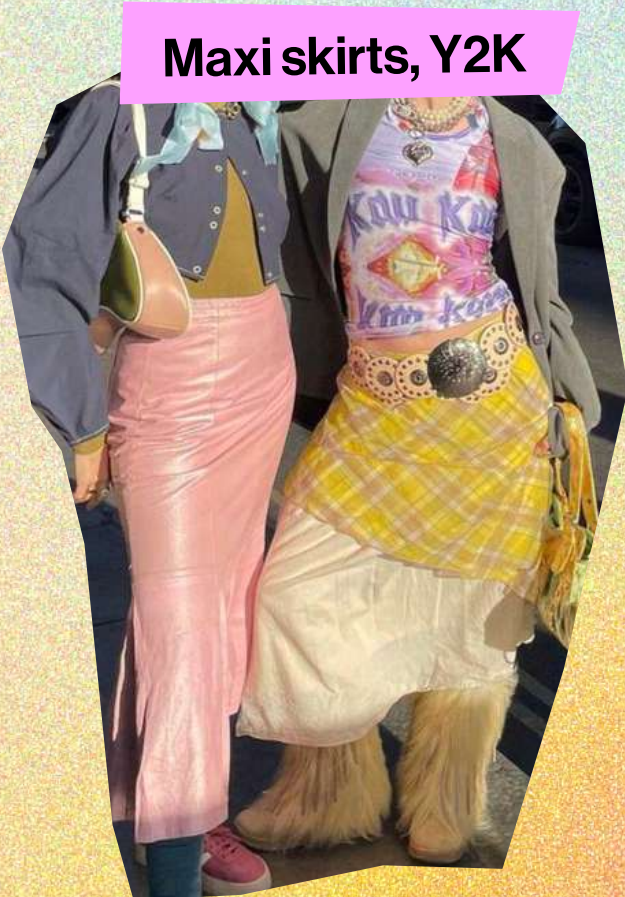
Maxi skirts, Y2K