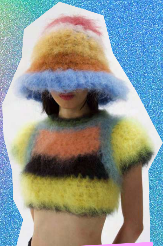
Fuzzy bucket hats