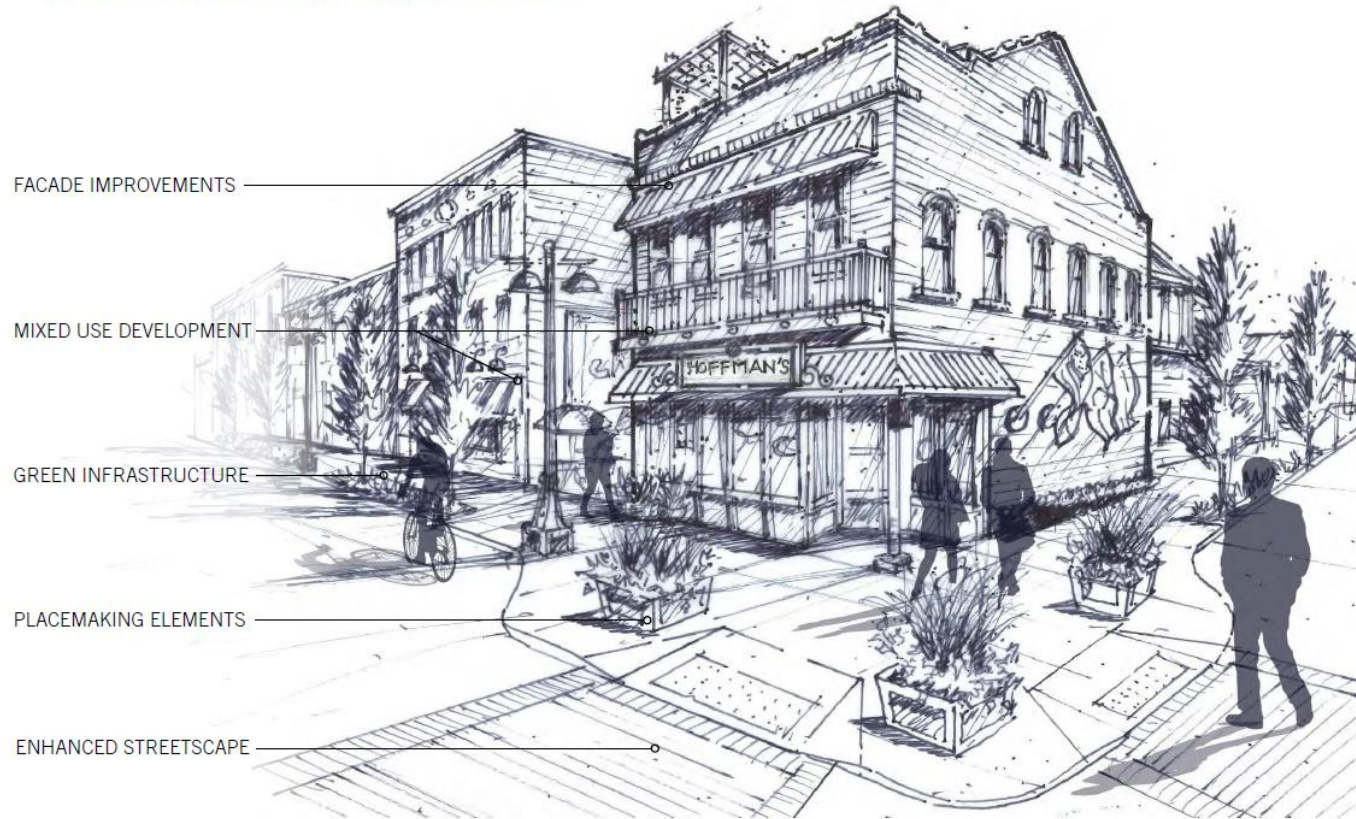
View of proposed improvements at the corner of Good Hope Street and South Sprigg Street (view to the southeast)