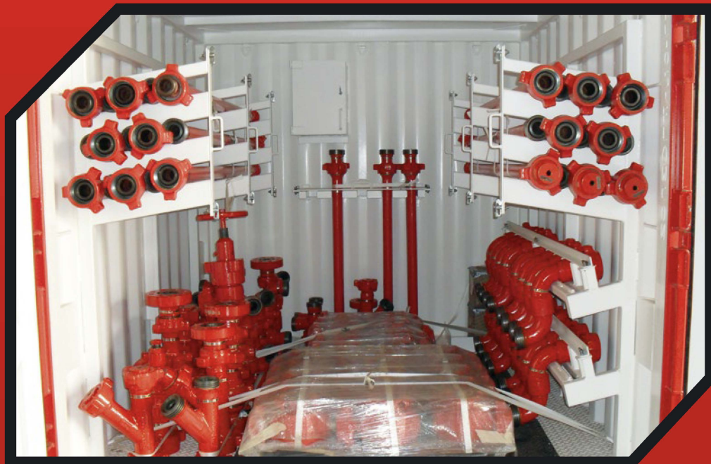
FLOWLINE EQUIPMENT MOBILISATION

In addition we manage and maintain client owned equipment within our one stop shop where we shot blast, redress and recertify your equipment by our experienced staff.