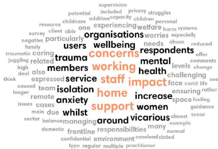
Figure 1: Word cloud showing most frequent terms in literature discussing the impact of the pandemic on the domestic abuse workforce

out personal rotas and systems with partners to ensure that childcare and privacy is resolved.” [25] With everyone at home, some survivors contacted services late into the night when they were free from family responsibilities, which in turn meant that services and staff had to be accessible during longer, less sociable hours.