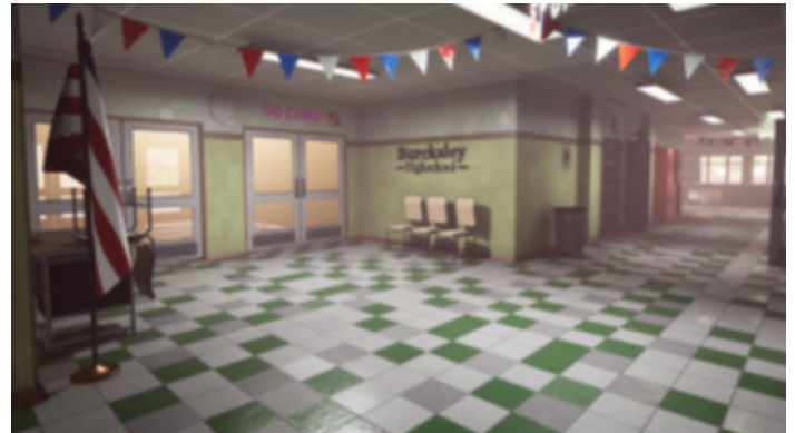
Fully adjustable environments provide realistic and ever-changing scenarios.