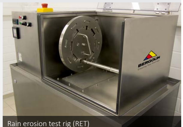
Rain erosion test rig (RET)

In addition to the certificates awarded by DEWI-OCC and Germanischer Lloyd, we set ourselves high standards so that we can always meet the quality demanded by our customers. For example, we have made the 3,000 hour UV and the rain erosion test standard. We can carry these out on our own equipment at any time.