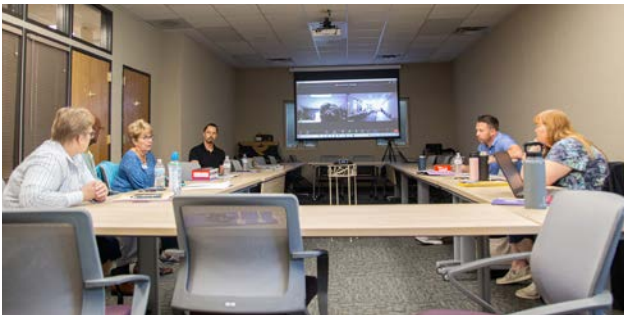
COMMUNITY DEVELOPMENT MEETING AT LOVE COLUMBIA

In early November 2023, Columbia successfully hosted its first training event, where 14 facilitators received training to lead the Good Dads 2.0 course. The enthusiasm is evident as several nonprofit organizations and faith leaders have committed to hosting Good Dads classes in the Columbia area, with classes scheduled to begin January 2024.