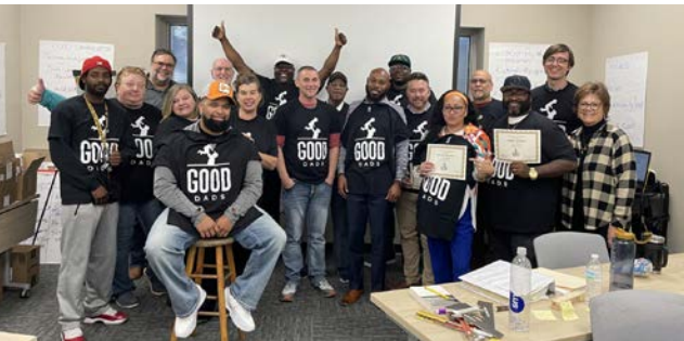
GOOD DADS 2.0 TRAINING AT LOVE COLUMBIA

Good Dads eagerly anticipates the addition of Columbia as its newest Community Chapter. The nonprofit Love Columbia is in the process of finalizing the agreement and significant strides have been made to officially welcome Love Columbia as a Community Chapter.