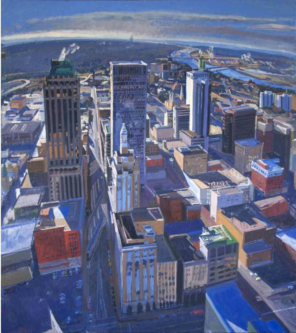
(Detail) Tulsa View · Oil on Linen · 84 x 72 2005