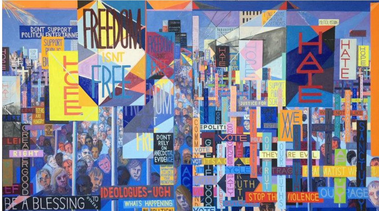
(Detail) March (Street Fiction) Oil on Canvas (on Board) · 108 x 192 2016-2017