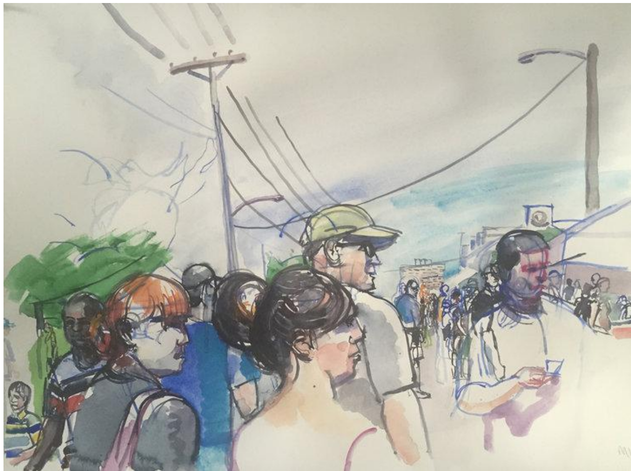
(Detail) Market (Black Hair, Ball Cap and a cup of tea · Watercolor on Paper · 22 x30 2017