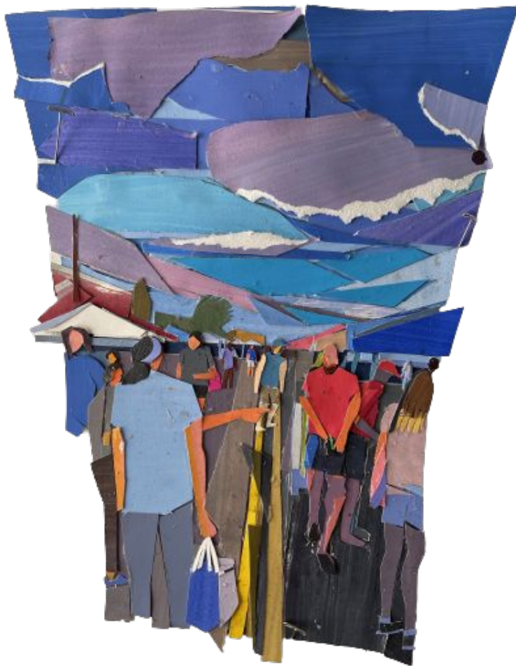
(Detail) Tulsa Farmers Market #7 (Cloudy, Blue Shirt, Red Shirt) · Acrylic and Paper Collage · 15 x 11 2023