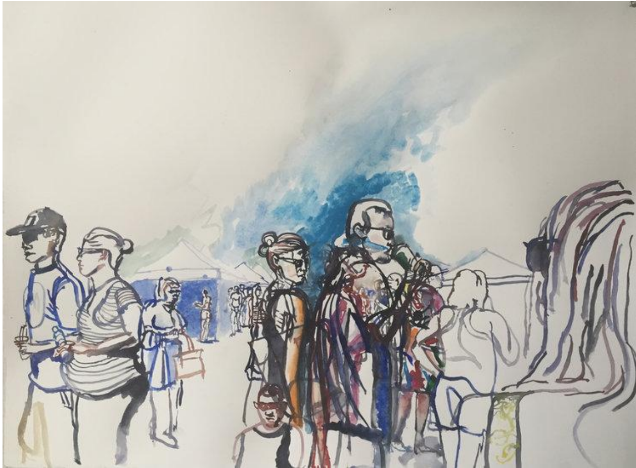
(Detail) Market (Drinking Coffee) · Watercolor on Paper · 22 x 30 2017