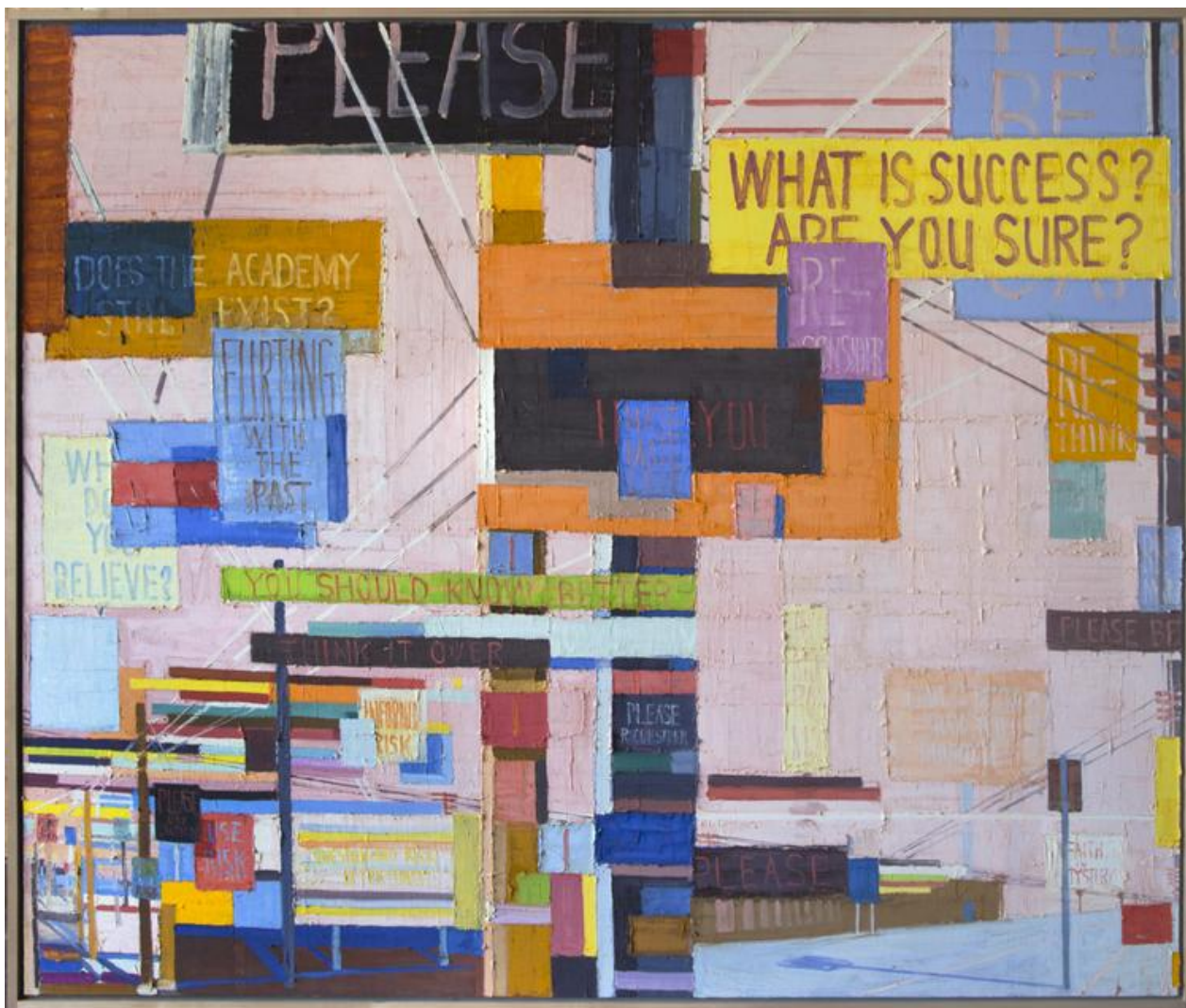
(Detail) Please (Street Fiction) · Oil on Canvas · 72 x 84 2012