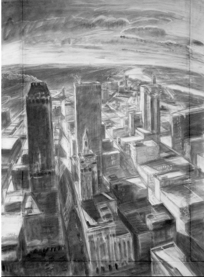
(Detail) Tulsa View · Graphite on Paper · 50 x 38 2007