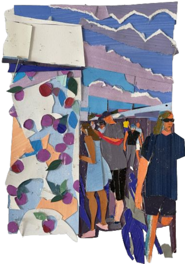
(Detail) Tulsa Farmers Market #10 (Patterned Drape) · Acrylic and Paper Collage · 13 x 9 2023