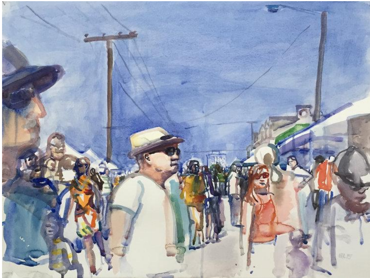
(Detail) Market (Hat) · Watercolor on Paper · 22 x 30 2017