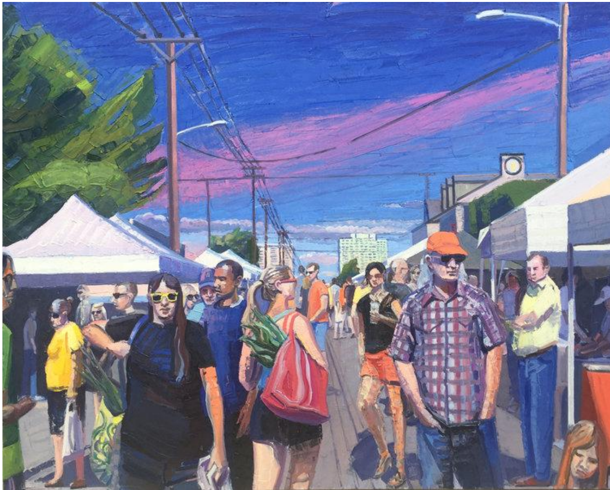
(Detail) Market · Oil on Canvas · 72 x 90 2015-17