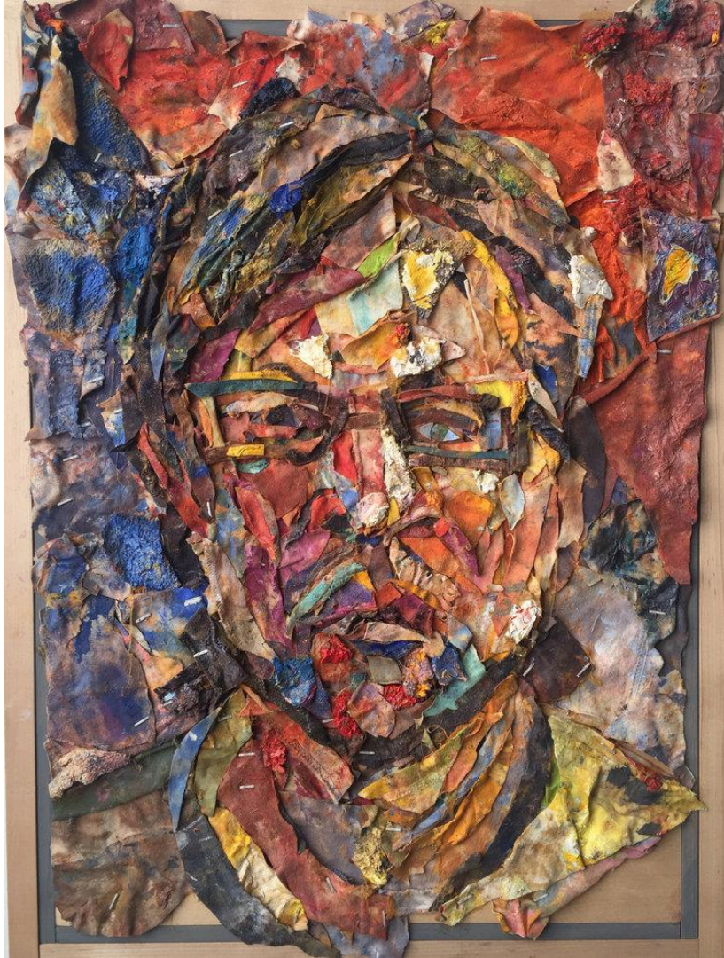
(Detail) Self-Portrait · Mixed Media, Paint Rags · 25 x 18 2014