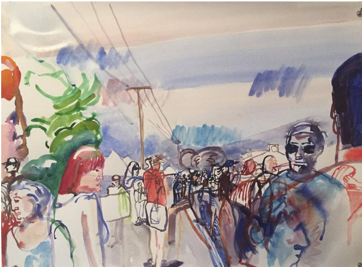
(Detail) Market (Red Hair) · Watercolor on Paper · 22 x 30 2017