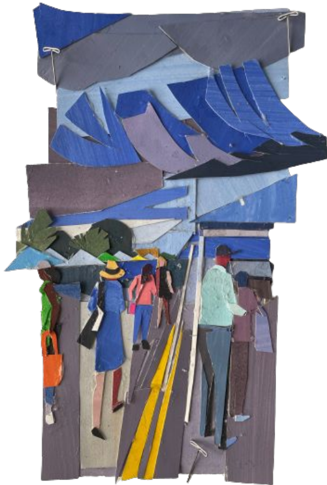
(Detail) Tulsa Farmers Market #6 (Cloudy, Yellow Sun Hat) · Acrylic and Paper Collage · 12 x 8 2023