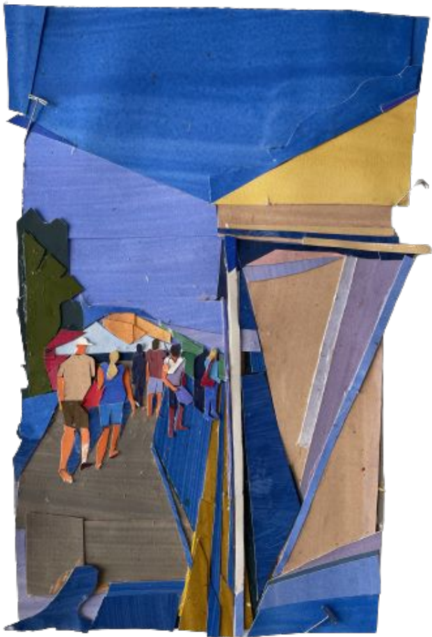
(Detail) Tulsa Farmers Market #8 (Tent, White Hat) · Acrylic and Paper Collage · 15 x 10 2023