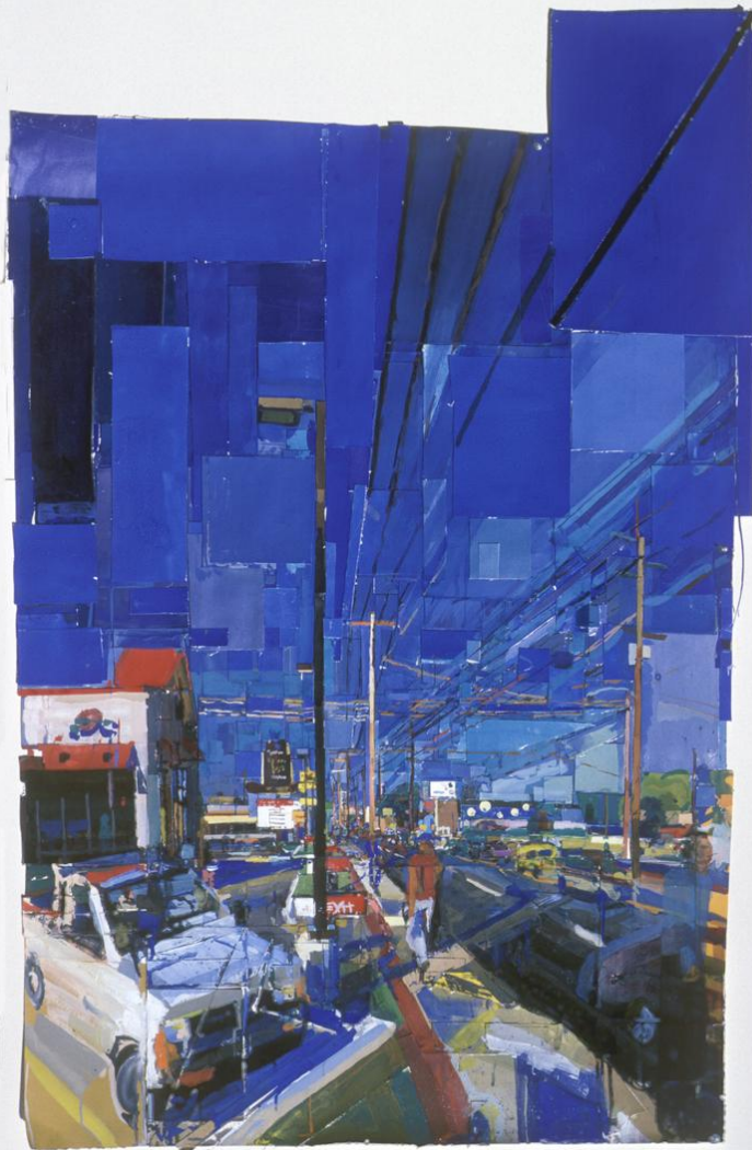
(Detail) 11th Street (#101) Gouache and Paper · 53 x 23 1997