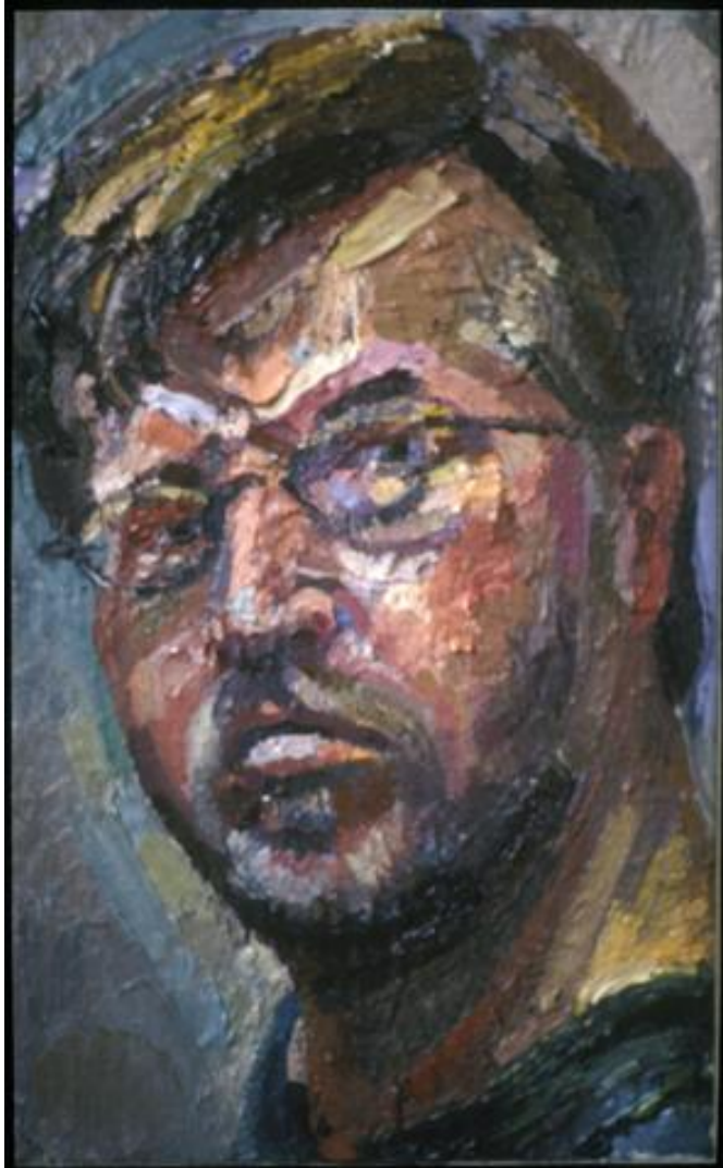
(Detail) Self Portrait · Oil on Linen · 16 x 11 2002