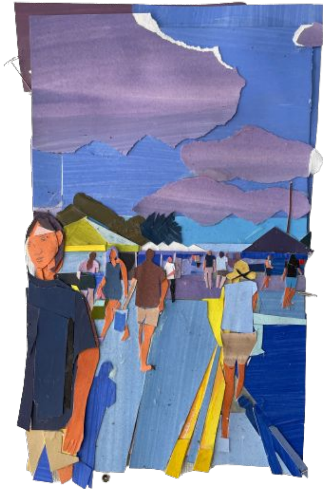
(Detail) Tulsa Farmers Market #9 (Yellow Stripes, Yellow Hat) Acrylic and Paper Collage · 15 x 9 2023