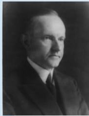
Calvin Coolidge, 30 th President of the United States (1923-1929)