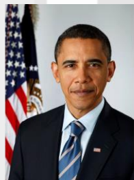
Barack Obama, 44 th President of the United States (2009-2017)