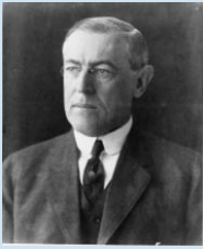
Woodrow Wilson, 28 th President of the United States (1913-1921)