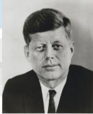
John F. Kennedy, 35 th President of the United States (1961-1963)