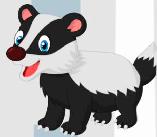
Josiah the Badger