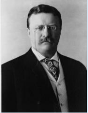
Theodore Roosevelt, 26 th President of the United States (1901-1909)

Match the President with their pet by looking at the "Presidential Pets" category in the Summer Reading 2021 Suggested Topic. It's on the homepage of our NewsBank resource. Or ask a librarian for help.