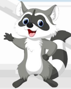
Rebecca the Raccoon