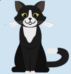
Socks the Cat