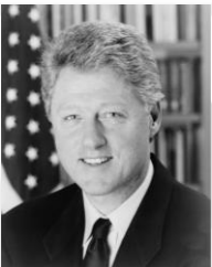
Bill Clinton, 42 nd President of the United States (1993-2001)