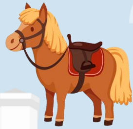
Macaroni the Pony