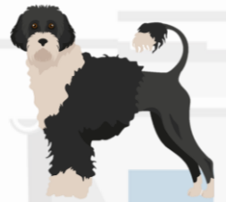
Bo the Portuguese Water Dog