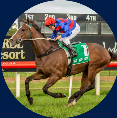
HIGH CLASS RACING