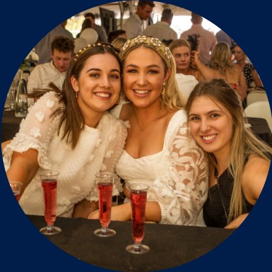
FINE FOOD & BEVERAGES

BE A PART OF THE THRILL & EXCITEMENT OF RACING AT WESTERN NSW'S PREMIER RACE CLUB