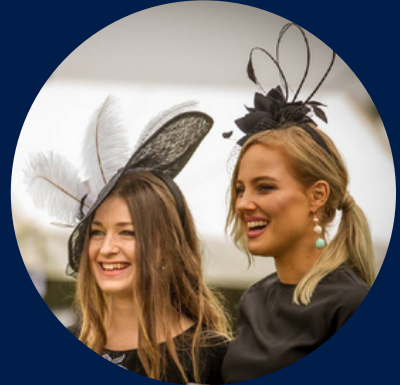
FASHION & LIVE MUSIC