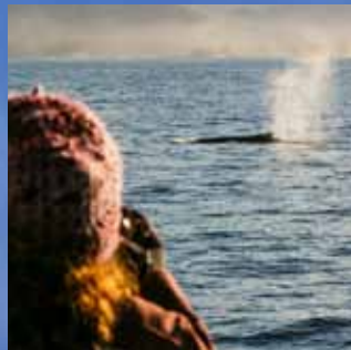
Sitka Whale Fest