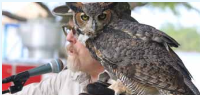
Indian River Lagoon Science Festival