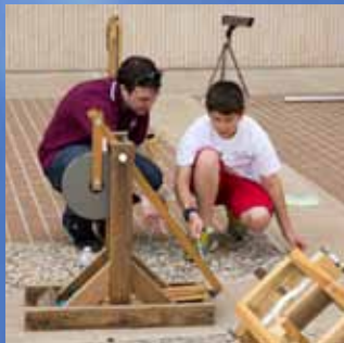
Texas A&M Physics and Engineering Festival