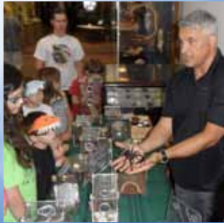
Las Vegas Science Festival