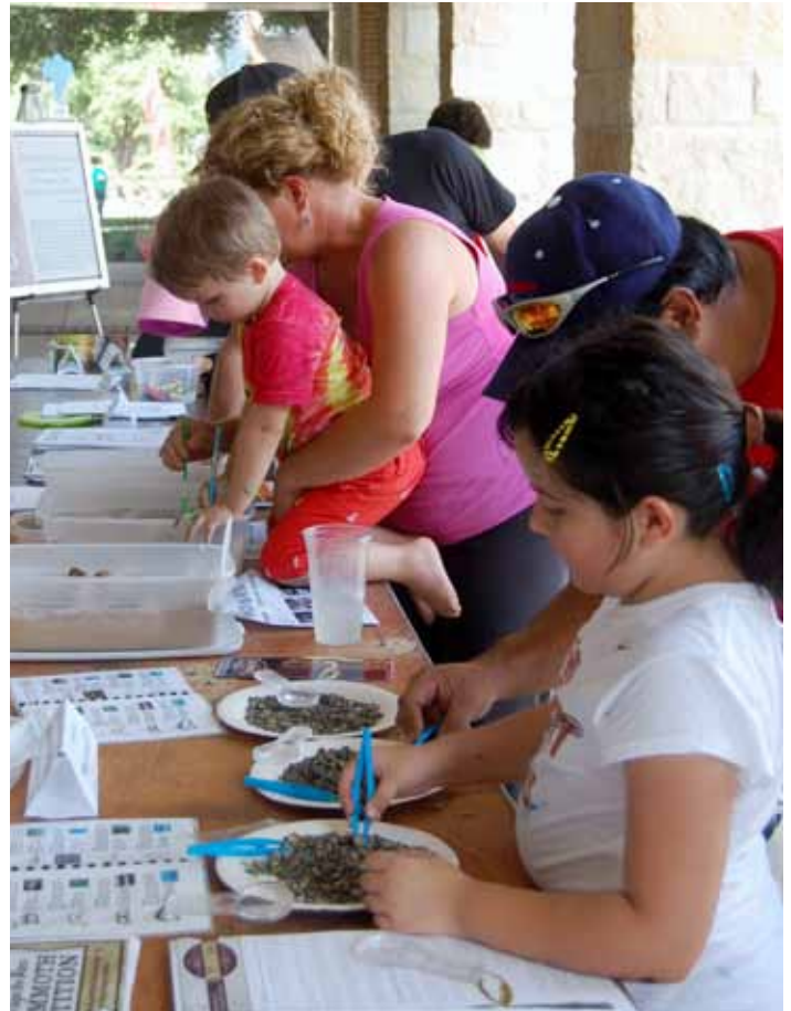
Waco Cultural Arts Fest Science Festival