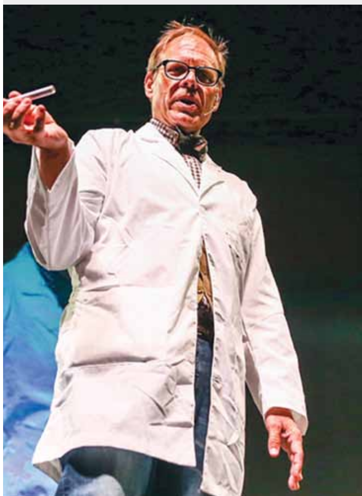
North Carolina Science Festival