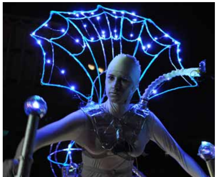
Arizona SciTech Festival