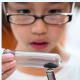
Wisconsin Science Festival WISCONSIN ALUMNI RESEARCH FOUNDATION