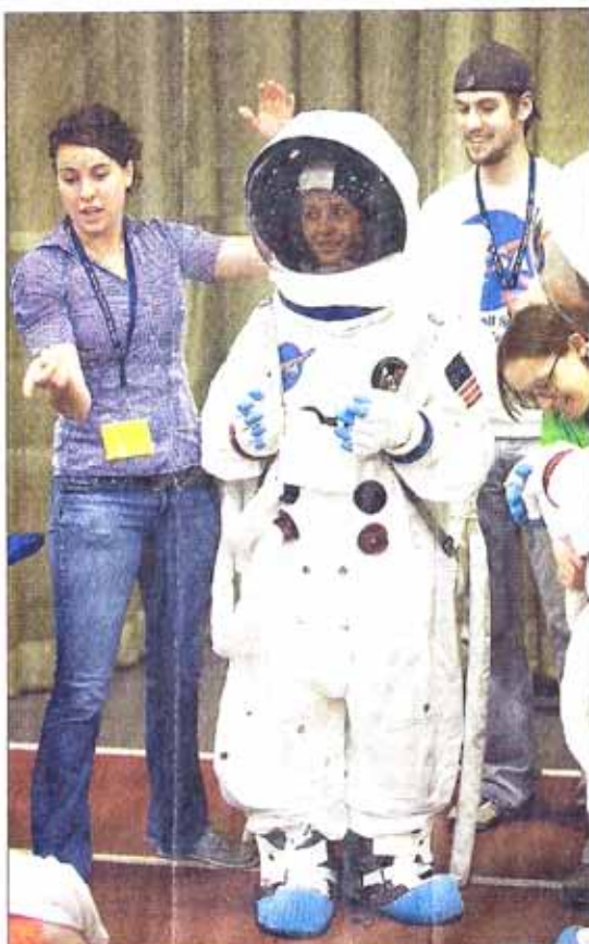
Massachusetts (and beyond): Grad students from MIT conduct a workshop for teens on the future of space travel during the 2009 Cambridge Science Festival.

From a Rubik's cube competition to nature walks in the southern Nevada wilderness, this festival, running April 29 to May 5, aims to show that there's more to Vegas than the Strip. Last year, events tackled such meaty topics as global warming and the relationship between science and religion. lasvegssciencefestival.com