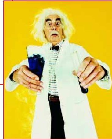
"Be like this guy. Go to the Science Festival."