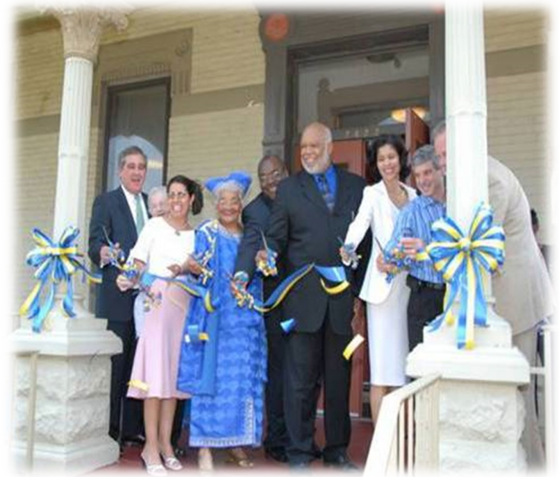
CHE Opening Hampton House Louisville, Kentucky

Through participatory research, policy advocacy , and a data-driven approach , we work with communities to remove social and economic barriers which result in a reduced quality of life and life expectancy, with a particular focus on those who have been historically and institutionally marginalized .