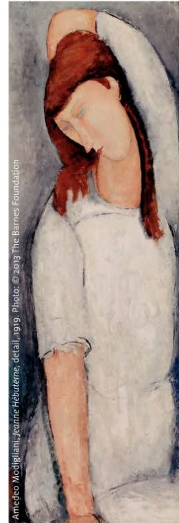
Amedeo Modigliani, Jeanne Hébuterne , detail, 1919.