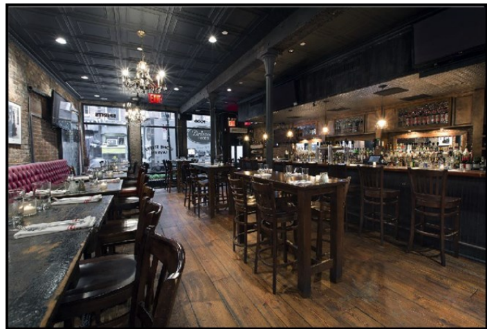
THE TAVERN BAR