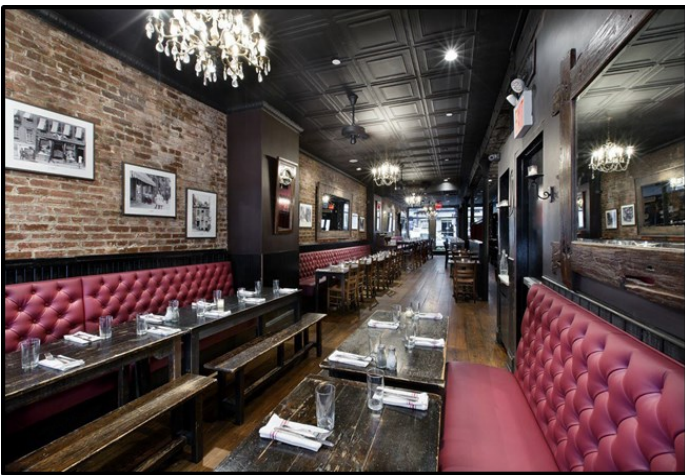
THE PEARL ROOM

Equally inviting to locals, visitors and people who work downtown, Stone Street Tavern is the perfect place to host your event. We are known for friendly service, delicious food, and flowing drinks. Able to accommodate groups up to 150 people, we to deliver customized events and customer service that will exceed your expectations.