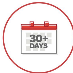
30+ Day Shelf-Life