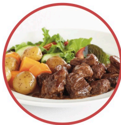
Safe Sous Vide™ Braised Diced Beef #4314