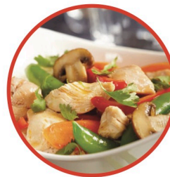
Safe Sous Vide™ Diced Chicken #8422