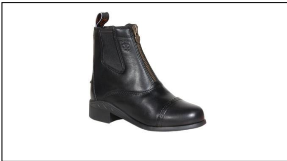
Ariat Zip Paddock Boot

Traditionally, they come in a lace-up and zip option in many different brands. Prices range from about $50-$150 for new boots, depending on brand and quality. Boots may also be purchased on consignment.