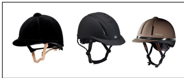
L-R: Charles Owen Hampton, Ovation Deluxe Schooling and Troxel Duratec

Helmets: Helmet requirements vary across the country, many shows require them at the tournament and academy level, and while they aren't worn as often in performance, the rules state that a rider will not be penalized for wearing a helmet. While not required, helmets are strongly recommended for all lesson students. Some popular brands include the Ovation Deluxe Schooling helmet ($60), the Charles Owen Hampton Helmet ($200), and the Troxel Duratec ($75). The most important thing when purchasing a helmet is to make sure it fits properly and is an ASTM/SEI Certified riding helmet (not a bike helmet). A poorly-fitting helmet can cause serious problems. When you have the helmet on, it should not be possible to pull it down over the eyes. We recommend helmets that have adjustment in the back so that they will fit any head and will grow with your child. Please do not purchase a used helmet – as the history is not disclosed and therefore they are no longer certified. If a helmet has been in an accident, a new helmet must be purchased. Just like with car seats, damage is often not noticeable, but it can no longer protect the rider sufficiently.