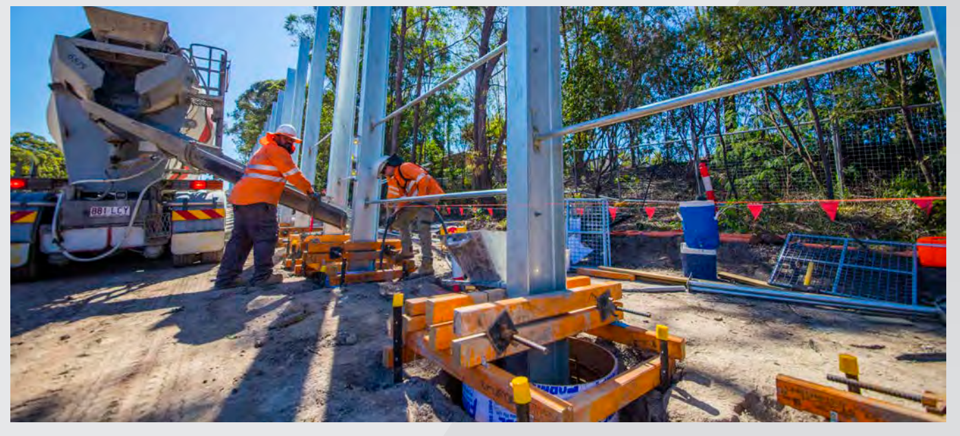
INSTALLATION OF STEEL NOISE BARRIER POSTS

Since the official start of construction in July 2016, there has been a burst of activity along the project alignment, particularly around Smith Street, the Smith Street Motorway, Olsen Avenue and Helensvale.