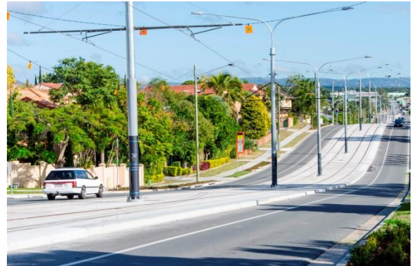
Overhead wires in Southport will be live

Overhead wires from Wardoo Street to Scarborough Street will be live and should be treated with caution. As long as you treat the overhead wires and poles as you would standard electricity poles and wires you will always be safe.