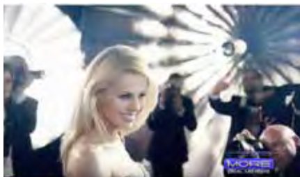
BHRC on Fox More Morning Show featuring Lasers | Beverly Hills Rejuvenation Center