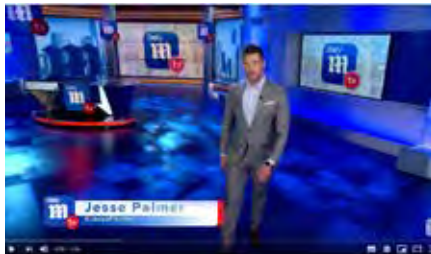
Daily Mail Video featuring BHRC and Dean Cain with host Jesse Palmer