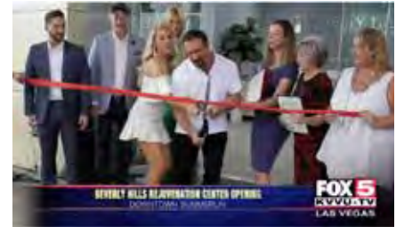
Beverly Hills Rejuvenation Center Boca Raton