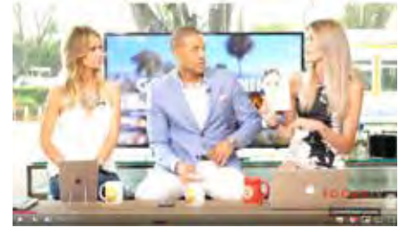
Beverly Hills Rejuvenation Center | Good Morning LaLa Land