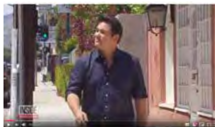
Inside Edition featuring Dean Cain's Regenerative Cell Therapy | Beverly Hills Rejuvenation Center