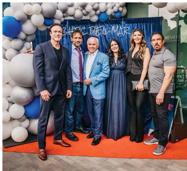
Print Title "Beverly Hills Rejuvenation Center Grand Opening"