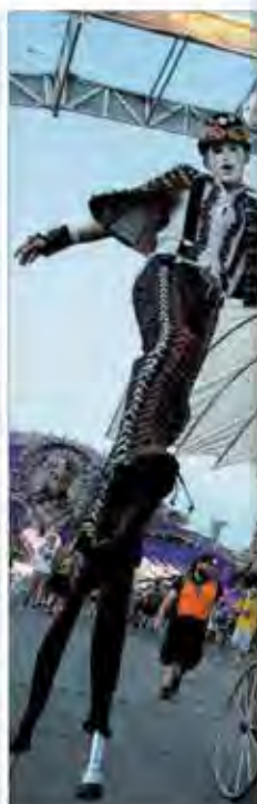
Artists groove Friday on the Parliament the first night of Electric Daisy Carnival at L