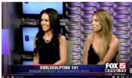
BHRC on Fox More Morning Show featuring CoolSculpting | Beverly Hills Rejuvenation Center