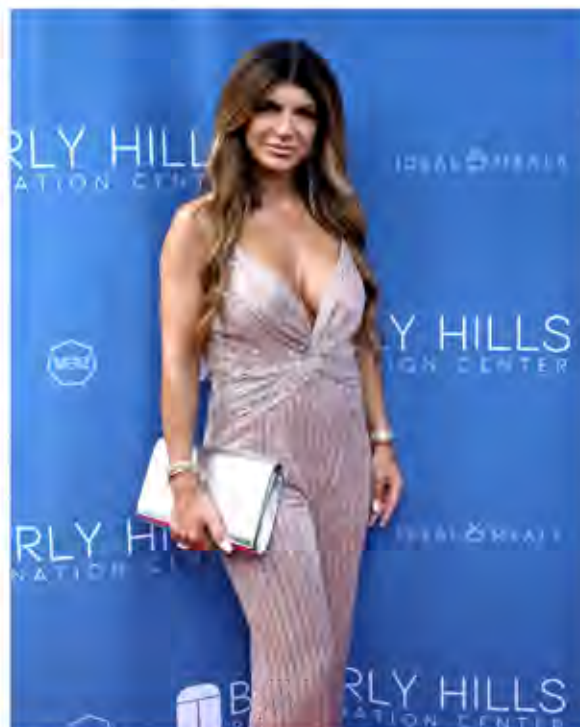
She's got front: The Real Housewives Of New Jersey star cut an incredibly glamorous figure as she showed off her eye-popping cleavage in a perilously plunging silver jumpsuit

'After completing his sentence he could've left the country and gone to Italy but he chose to stay in prison, hire additional counsel and make several more appeals to try to stay in the United States because he knows how much his family needs him.'