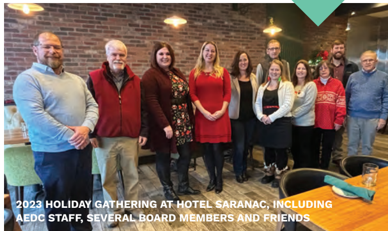
2023 HOLIDAY GATHERING AT HOTEL SARANAC, INCLUDING AEDC STAFF, SEVERAL BOARD MEMBERS AND FRIENDS

The loan dollars provided have allowed an expansion of this important business in Malone and for services reaching far beyond.