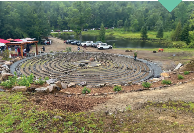
ADIRONDACK LABYRINTH ATTRACTION AT ASA ADIRONDACK (BAKERS MILLS)

Adirondack Labyrinth. Unveiled in July 2023, it is the Seventh Legacy Labyrinth in the world, a part of a network of labyrinths dedicated to healing and peace. In the first three months of the labyrinth's operation, almost 1,000 visitors came to enjoy some inner balance and calm!