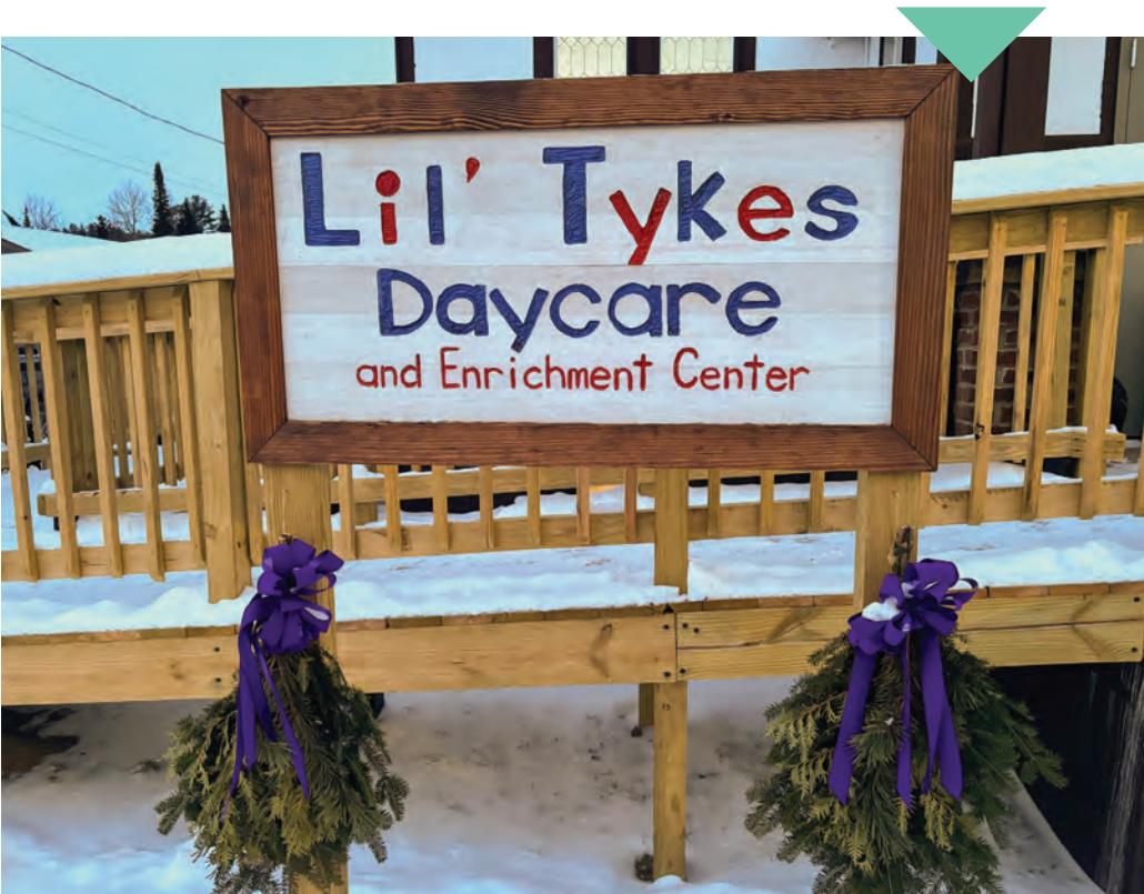
LIL' TYKES DAYCARE (BLOOMINGDALE)

The childcare facility will accommodate 8 infants, 16 toddlers, and 10 after-school children and will employ 5 certified daycare providers. We are so excited to see the center open.