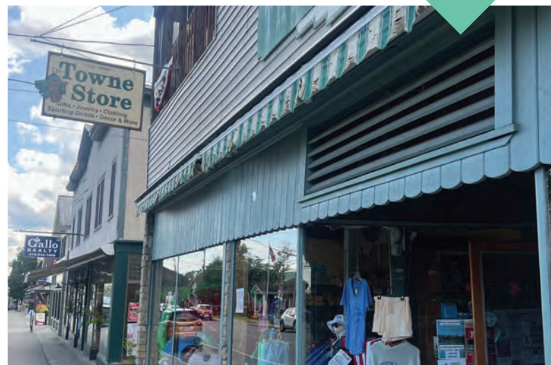
THE TOWNE STORE IN DOWNTOWN SCHROON LAKE