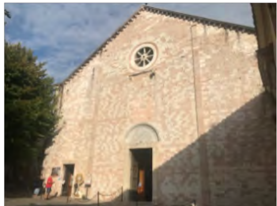
The Church of La Spogliazone