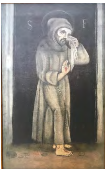
St Francis & his blindness and stigmata

Grant me the grace that I need to live out this endeavour .... Our Father. Hail Mary. Glory Be.