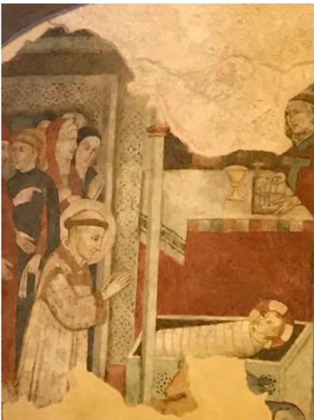
St Francis adoring the Crib in Greccio

Grant me the grace that I need to live out this endeavour .... Our Father. Hail Mary. Glory Be.