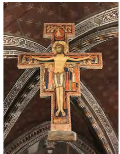
The Cross of San Damiano

Grant me the grace that I need to live out this endeavour .... Our Father. Hail Mary. Glory Be