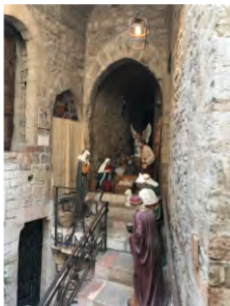
The house in which St Francis lived and was born.