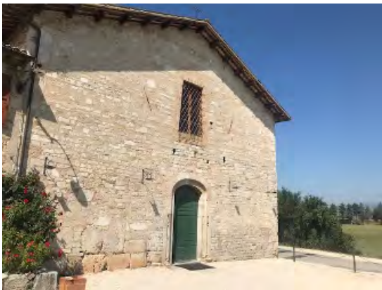
Church of San Sabino where St Francis was told to return to Assisi

Grant me the grace that I need to live out this endeavour .... Our Father. Hail Mary. Glory Be.