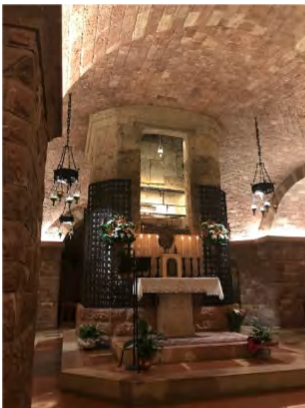
The tomb of St Francis of Assisi

Grant me the grace that I need to live out this endeavour .... Our Father. Hail Mary. Glory Be