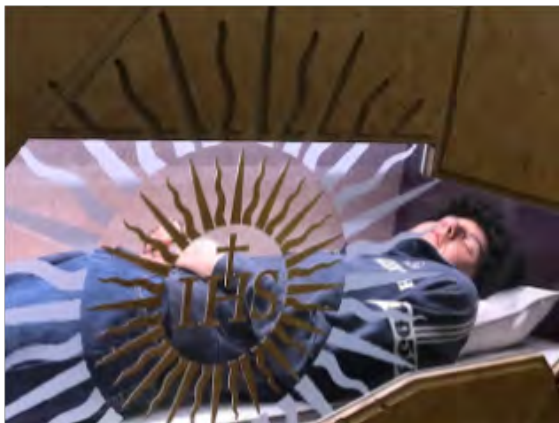
Blessed Carlo Acutis

Grant me the grace that I need to live out this endeavour .... Our Father. Hail Mary. Glory Be