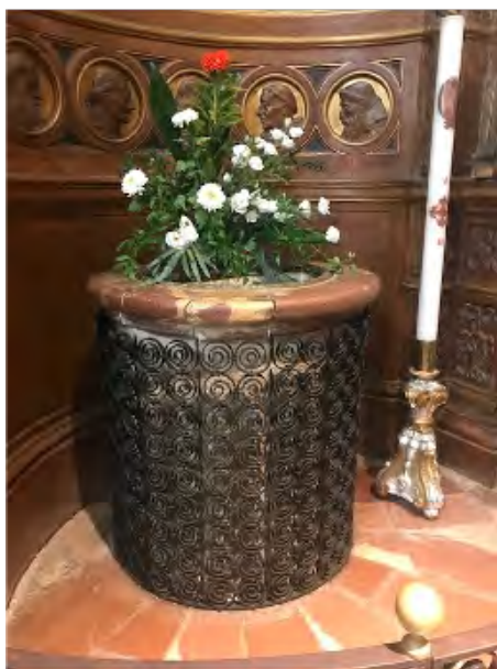
The font in which Saint Francis was baptised.

Grant me the grace that I need to live out this endeavour... Our Father. Hail Mary. Glory Be.