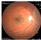
View through undilated pupil