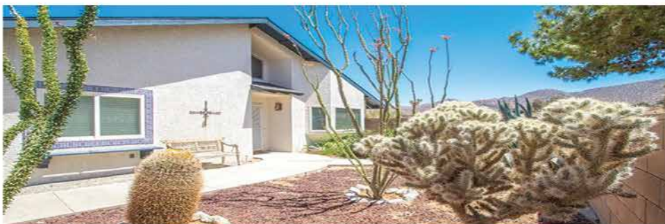
EXQUISITE VIEW PROPERTY! 3 BEDROOM, 2 BATH HOME WITH PRIDE OF OWNERSHIP Stunning interior/exterior. High ceilings. Fireplace. Large enclosed sunroom. Spa. Laundry room. 2 car garage. 7815 Sunset Road, Joshua Tree. Asking $549,000.