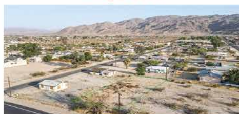
1.38 ACRE - Other two next to it for sale too! 63560 Twentynine Palms Hwy, 29 Palms. Asking $30,000.