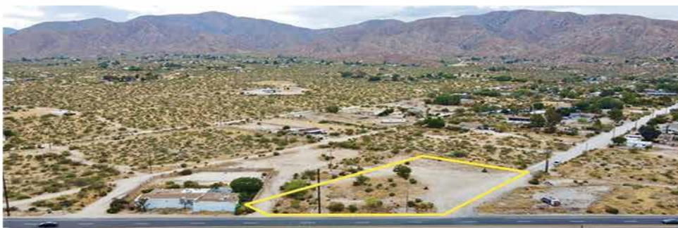
PRIME 1 ACRE OF LAND OFF OF HIGHWAY 62 General Commercial. Power already on street. Water meter just needs to be activated. 51586 Twentynine Palms Highway, Morongo Valley. Asking $55,000.