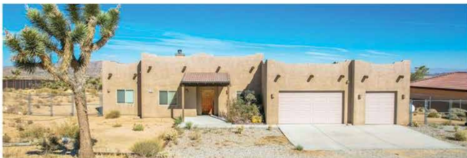
WONDERFUL 4 BEDROOM, 2 BATH ADOBE STYLE HOME ON OVER AN ACRE IN FRIENDLY HILLS Amazing view! 2304 sq.ft. High ceilings. Fireplace. Laundry room. Three bay huge garage! 61246 Onaga Trail, Joshua Tree. Asking $699,900.