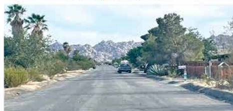
.23 ACRE COMMERCIAL LOT IN INDIAN COVE 0 Twentynine Palms Hwy, 29 Palms. Asking $45,000.