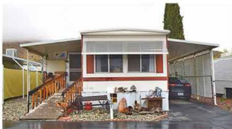
1 BEDROOM, 1 BATH MOBILE HOME Apache Senior Park. Nice flooring. Enclosed deck with laundry. 56254 29 Palms Hwy, Sp#121, Yucca Valley. Asking $38,000.