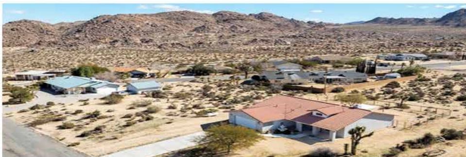
4 BEDROOM, 2 BATH IN MONUMENT MANOR NEIGHBORHOOD OF UPPER FRIENDLY HILLS Open floor plan. Doubled sided fireplace. Chef's kitchen. Panoramic views. Backyard fireplace. 61745 Pueblo Trail, Joshua Tree. Asking $549,900.