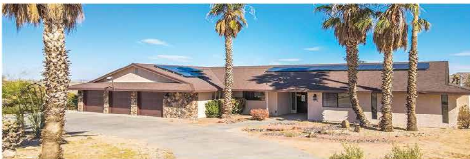
STUNNING 3 BEDROOM, 2.5 BATH HOME ON 2.35 VIEW ACRES IN JOSHUA TREE Open floor plan. Impressive rock fireplace. Master bedroom with en-suite bathroom. 7075 Sunny Vista Road, Joshua Tree. Asking $499,900.