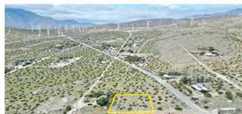
HALF ACRE IN PAINTED HILLS NEIGHBORHOOD Water and Power nearby. 0 Painted Hills Road, Whitewater. Asking $49,800.