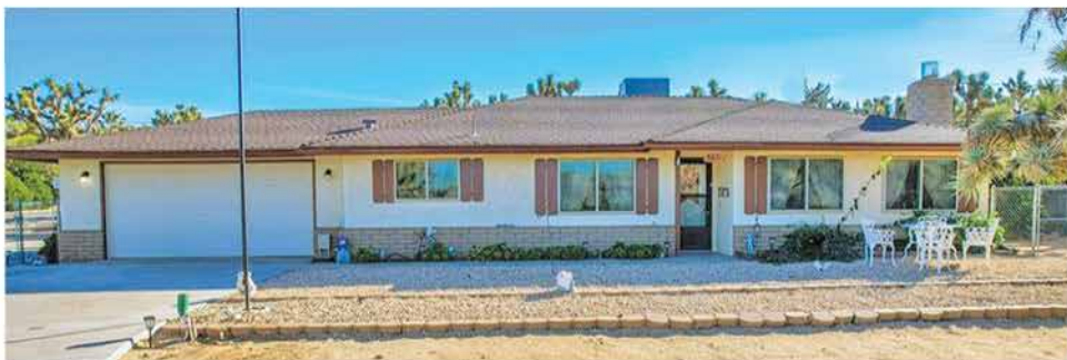
EXQUISITE 3 BEDROOM, 2 BATH HOME IN THE SERENE BEAUTY OF STOREY PARK Double garage plus 3-car garage used as a giant bonus room. Master suite with en-suite bathroom. 56711 Joshua Drive, Yucca Valley. Asking $450,000.