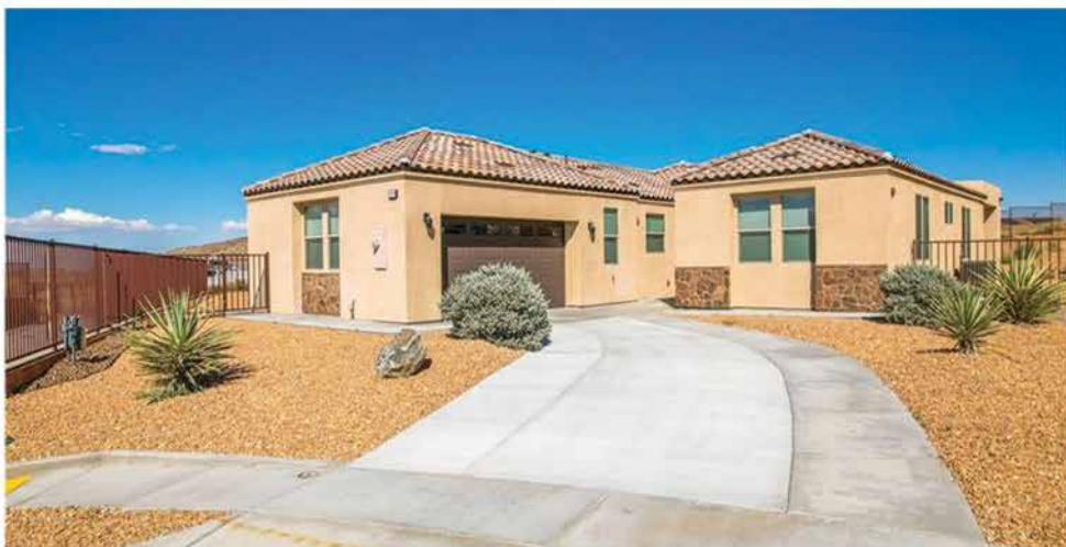
STUNNING 3 BEDROOM, 2.5 BATH HOME ON OVER A QUARTER ACRE WITH VIEWS! Located in picturesque Golden Bee area. 2026 sq.ft. of meticulously designed living space. 56959 Hidden Gold Court, Yucca Valley. Asking $478,000.