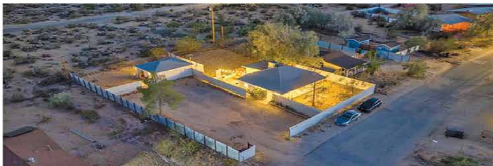
TWO EXQUISITELY RENOVATED BUNGALOWS ON PRIVATE LOT WITH PANORAMIC VIEWS "The Zen" 2 bedroom, 1 bath and "The Naturalist" Bungalow. Zen oasis. Privacy fencing. 61879 Valley View Circle, Joshua Tree. Asking $598,000.