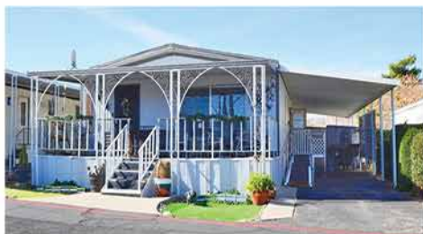
2 BEDROOM, 2 BATH MOBILE HOME Beautiful and clean Doublewide. Wood flooring. Covered porch. Covered parking and 1 shed for storage. 7425 Church Street Sp.#11. Yucca Valley. Asking $55,000.