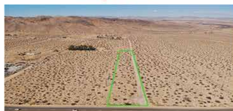
4 ACRES RIGHT ON THE HIGHWAY 0 Twentynine Palms Hwy, 29 Palms. Asking $19,000.