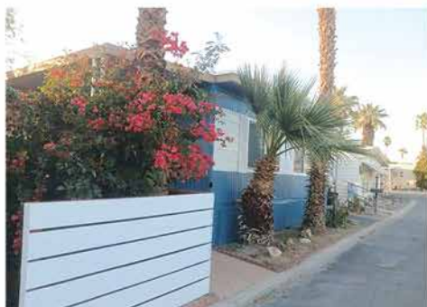
2 BEDROOM, 2 BATH MANUFACTURED HOME Completely renovated. 55+ Gated Community. 51555 Monroe Street, Sp.#92, Indio. Asking $130,000.