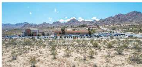
2.29 PRIME COMMERCIAL 63560 Twentynine Palms Hwy, Joshua Tree. Asking $150,000.