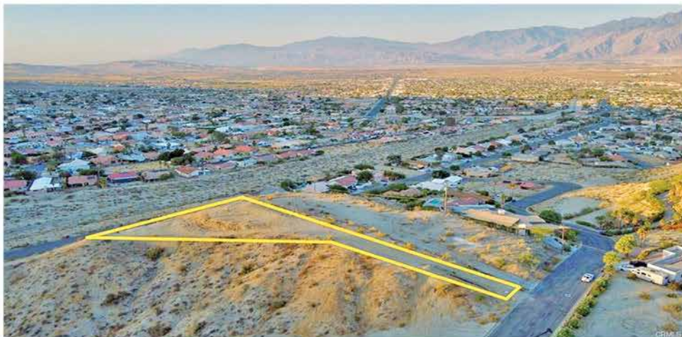
FABULOUS .66 ACRE LOT PERCHED HIGH & TUCKED BACK IN THE MOUNTAINS WITH ENDLESS VIEWS Seller has plans for a spectacular Miesian modern home almost complete and available. 9062 Calle De Vecinos, Desert Hot Springs. Asking $149,900.