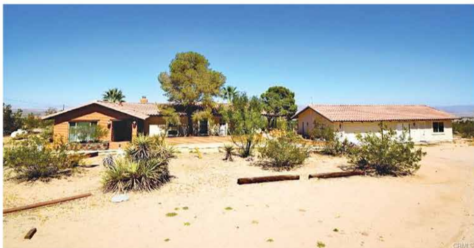
UPGRADED 2 BEDROOM, 2 BATH, PLUS BONUS ROOM ON 2.5 ACRES IN SHERMAN HEIGHTS 2093 sq.ft. home, plus fully furnished casita with attached 3-car garage. Chef's kitchen! 6749 Sherman Road, 29 Palms. Asking $550,000.