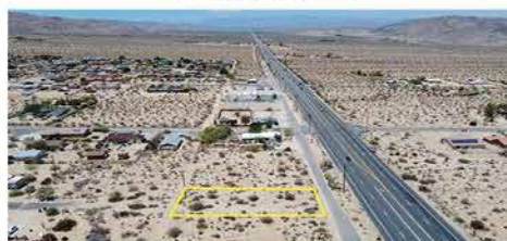
3 COMMERCIAL LOTS 0 Twentynine Palms Hwy, 29 Palms. Asking $74,999.