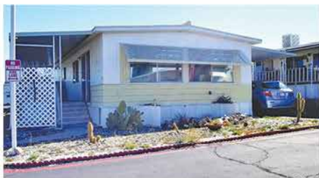
2 BEDROOM, 2 BATH MOBILE HOME Doublewide on corner lot. Overlooking the desert. Senior park. Close to shopping. 7425 Church Street Sp.#75. Yucca Valley. Asking $55,000.