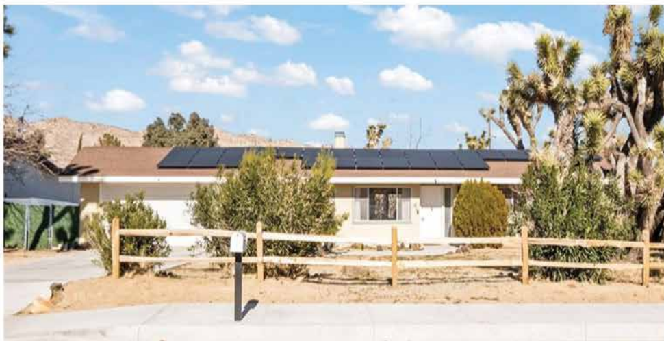
TURNKEY 3 BEDROOM, 2 BATH HOME WITH BONUS ROOM ON .427 ACRES Fireplace. Updated kitchen. Attached 2-car garage. Custom deck. Solar! Fenced backyard. 56454 Onaga Trail, Yucca Valley. Asking $489,000.