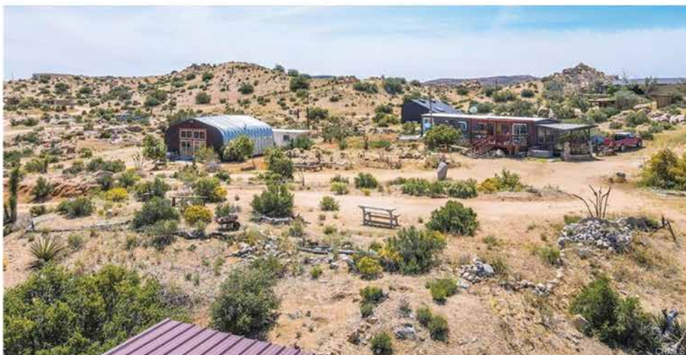
A SPECIAL AND UNIQUE PROPERTY LOCATED IN FAMOUS PIONEERTOWN 2 bedroom, 1 bath on 2.5 acres with unobstructed boulder views. Quonset hut. Travel trailer. 52131 Pipes Canyon Road, Pioneertown. Asking $475,000.