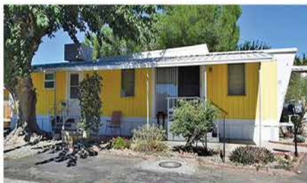
1 BEDROOM, 1 BATH MOBILE HOME Senior park. Close to golf course. Wood flooring. Clean. Nice shed. 55524 Yucca Trail, Sp.#50, Yucca Valley. Asking $41,000.