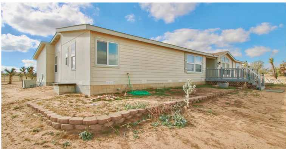
HORSE PROPERTY! 4 BEDROOM, 2.5 BATH MANUFACTURED HOME ON 2.5 ACRES 2960 sq.ft. Stunning fireplace. Primary suite with personal office. Deck with views! Fenced! 58425 Sunny Sands Drive, Yucca Valley. Asking $475,000.