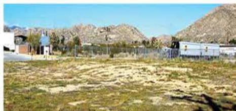
0.27 ACRE LOT WITH PAID WATER METER 7243 Mohawk Trail, Yucca Valley. Asking $139,900.