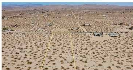
2.58 ACRES COMMERCIAL RURAL 1155 Belfield Boulevard, Landers. Asking $169,000.