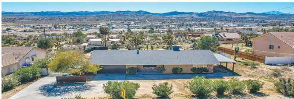
2 BEDROOM, 2 BATH HOME IN WESTERN HILLS ESTATES WITH BREATHTAKING VIEWS! Modern comforts and timeless elegance. Updated kitchen. Enclosed sunroom. 2 car garage. 57455 Paxton Road, Yucca Valley. Asking $379,900.