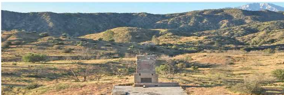
DISCOVER THE BEAUTY OF THIS EXPANSIVE 5 ACRE IN NORTH WEST MORONGO VALLEY A luxury of privacy with views! Utilities believed to be nearby. (Buyer verify). 48658 Lyle Road, Morongo Valley. Asking $100,000.