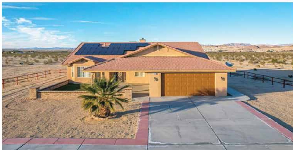
3 BEDROOM, 2 BATH LUXURY POOL HOME ON 2.29 ACRES WITH A WELL - PAID SOLAR! Covered patio entry. Fireplace. Primary bedroom with en-suite bath. Oversized 2 car garage. 73250 Indian Trail, 29 Palms. Asking $550,000.