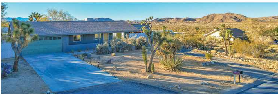
REIMAGINED 2 BEDROOM, 2 BATH, BONUS ROOM HOME WITH MODERN ELEGANCE Meticulous unparalleled beauty and style. Vaulted ceilings. Chef's kitchen. Custom features. 6732 San Angelo Avenue, Joshua Tree. Asking $535,000.