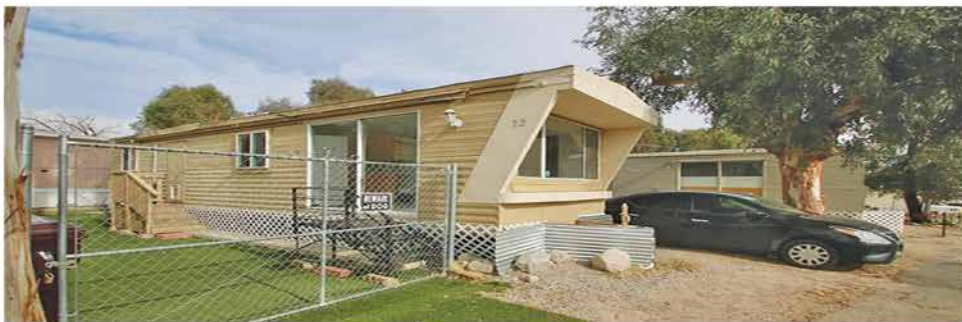
DELIGHTFUL 1 BEDROOM, 1 BATH MOBILE HOME IN ROADRUNNER MOBILEHOME PARK Well maintained interior. Tile flooring. Thoughtfully designed kitchen. Mini split system. 51063 Twentynine Palms Highway, Sp.#32, Morongo Valley. Asking $20,000.