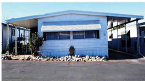
2 BEDROOM, 2 BATH MOBILE HOME Doublewide completely remodeled. Bonus room. Stunning new kitchen. Laundry room. 7425 Church Street Sp.#10. Yucca Valley. Asking $99,900.