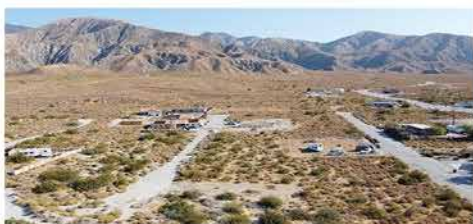
GORGEOUS FLAT QUARTER OF AN ACRE IN WHITEWATER Zoning allows for SFR, Duplex, or Fourplex 0 Hyacinth Lane, Whitewater. Asking $50,000.