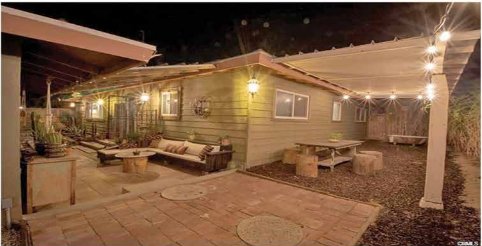
RARE AND FULLY FURNISHED INCOME PROPERTY! STUNNINGLY REMODELED DUPLEX In the Joshua Tree Village. Two 2 bedrooms, 1.5 baths. Private covered patios. Fully fenced. 61944 Commercial Street, Joshua Tree. Asking $839,900.