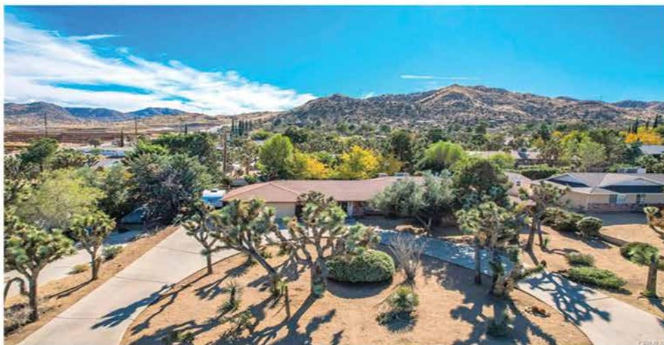
METICULOUSLY CRAFTED CUSTOM 3 BEDROOM, 3 BATH HOME IN STOREY PARK 2663 sq.ft. Pride of Ownership. Den. Bonus room. Fireplace. Above ground pool. She-shack. Oversized 2-Car Garage. RV parking with dump station. 56849 Hidden Gold Drive, Yucca Valley. Asking $485,000.