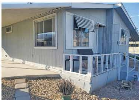
2 BEDROOM, 2 BATH MANUFACTURED HOME Corner Lot close to Pool. 55+ Gated Community. 51555 Monroe Street, Sp.#112 Indio. Asking $84,900.