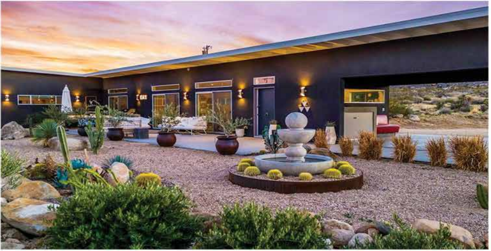
METICULOUSLY AND THOUGHTFULLY DESIGNED NEWER 2 BEDROOM, 2 BATH HOME ON 2 ACRES Beautiful concrete flooring. Fully furnished, including Hot Spring Spa. Stunning mountain views. Close to the Joshua Tree National Park Entrance. 7802 Quail Springs Road, Joshua Tree. Asking $850,000.