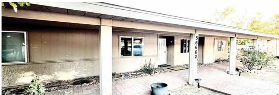
BEAUTIFUL 3 BEDROOM, 2 BATH HOME ON A LARGE CORNER LOT IN STOREY PARK Fireplace. Updated appliances. Covered patio and deck. 2 car garage. Fenced yard. 56662 Desert Gold Drive, Yucca Valley. Asking $440,000.