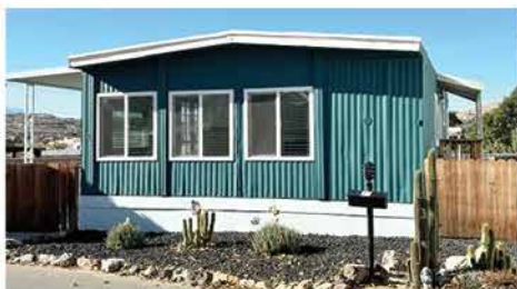
2 BEDROOM, 1 BATH MOBILE HOME Completely remodeled and upgraded. New flooring and paint. Covered patio. Beautiful views! 55524 Yucca Trail, Sp.#22, Yucca Valley. Asking $69,500.