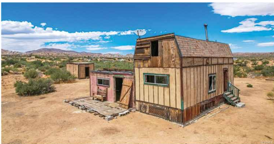
PIPES CANYON 1 BEDROOM, 1 BATH CABIN ON 5.31 ACRES Moments from Pioneertown. Bring your tools, creativity, and create your dream home! 2770 Eastline Road, Pioneertown. Asking $165,000.