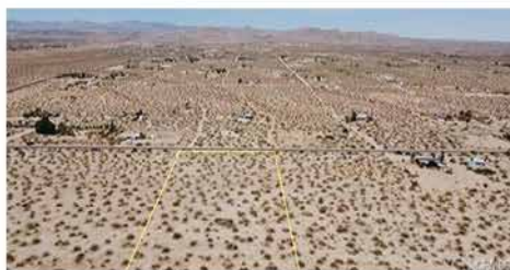
5.18 ACRES COMMERCIAL RURAL 1153 Belfield Boulevard, Landers. Asking $349,000.