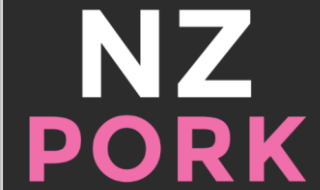
TREND IN THE WEEKLY PIG KILL