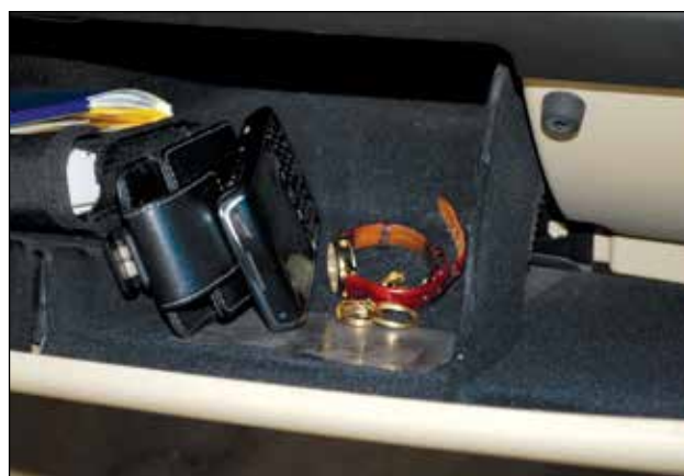
Leave all valuables in your car. Do not bring items with you that cannot be disinfected.