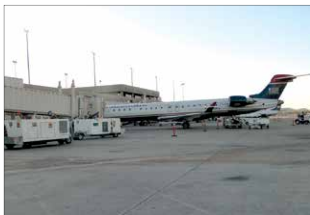
Follow farm policy for downtime following international travel: Depending on what country you traveled to, as well as your activities while you were there, may affect the procedures you follow upon your return.