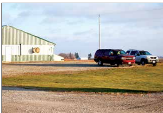
Visitors must park in the designated area if there is one; otherwise, park away from areas where animals are housed.