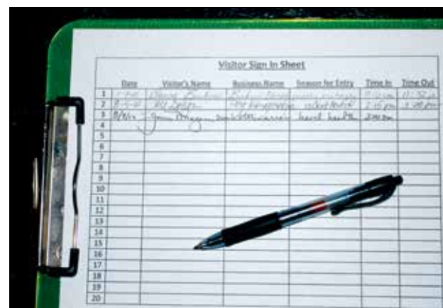
Sign in at visitors' log if one is available.