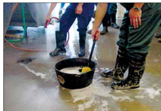
Always follow farm policy concerning general biosecurity practices.