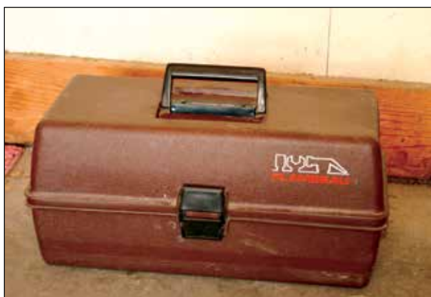
All service personnel should only bring equipment that has been approved for entry and has been cleaned and disinfected.