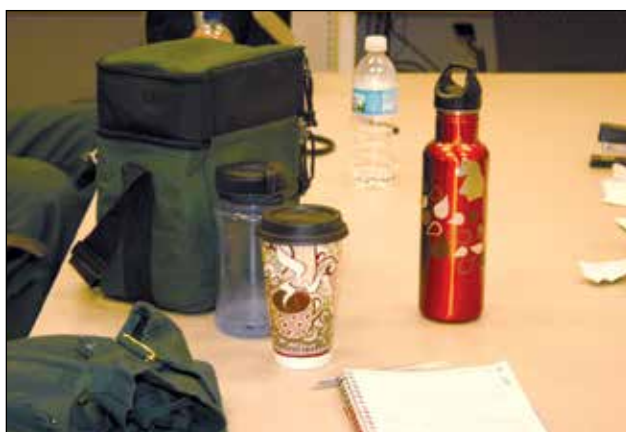
Eating is prohibited in animal areas. Keep any food in a breakroom or office if it is necessary to bring it into the building.