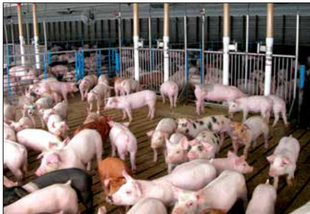
Let farm personnel know if you have been in contact with other pigs during the last 48 hours.

Please review these guidelines before entering the facility.