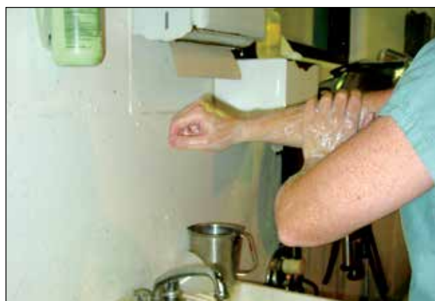
All visitors must wash their hands or shower in/shower out as set by the farm policy.