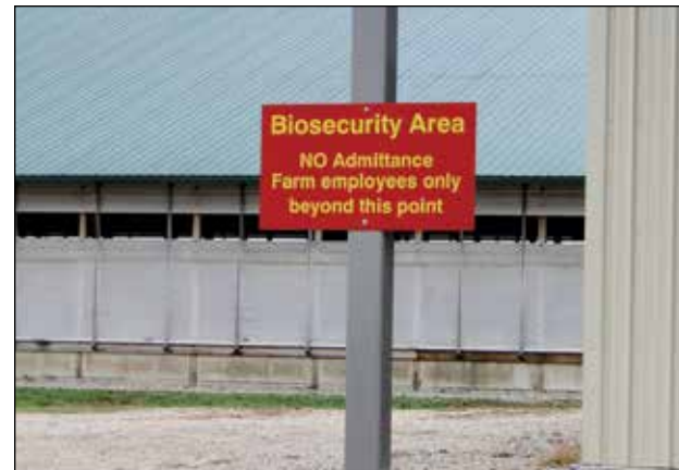
Do you have permission to enter this facility? Only essential visitors are allowed on this production site. You need to have permission before you enter.