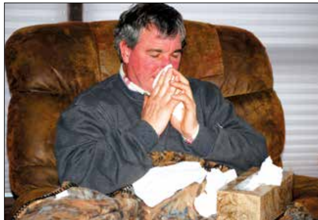
Do not enter the building if you are sick.