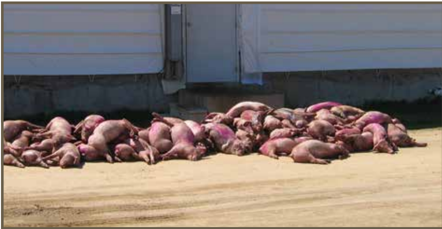
HIGH DEATH LOSS